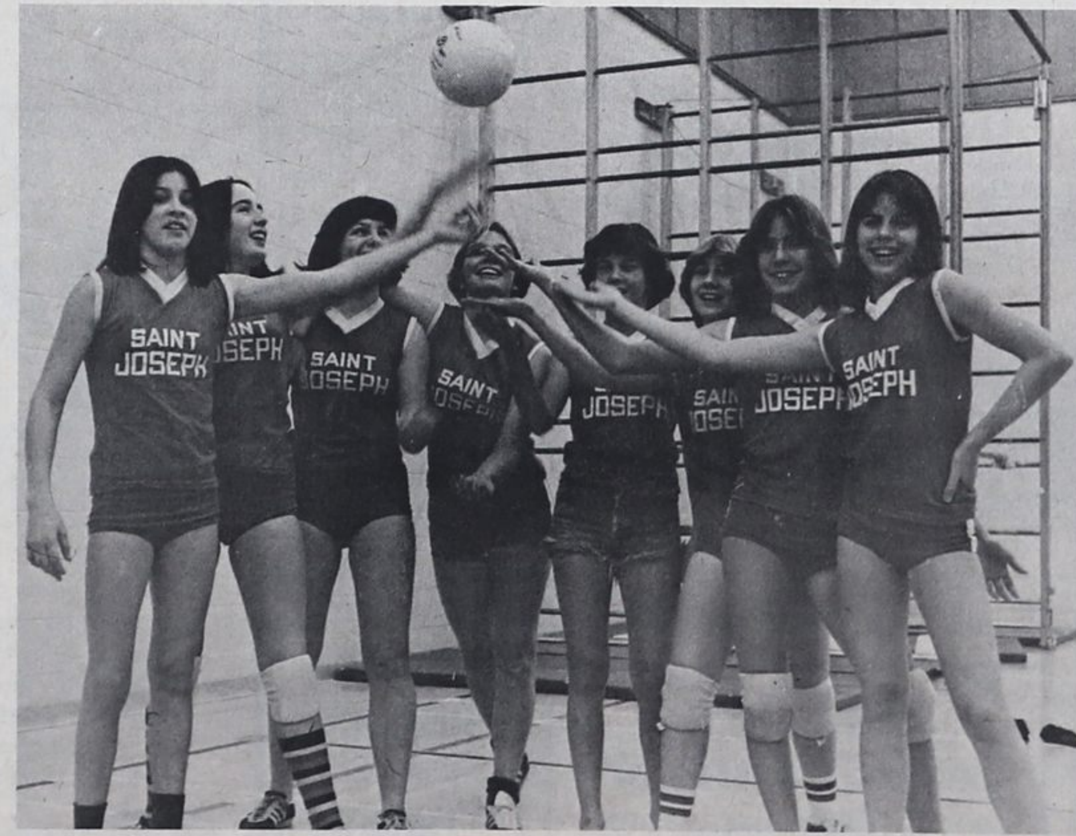
They're the champs

All the teams came back with a fine effort in the second game.