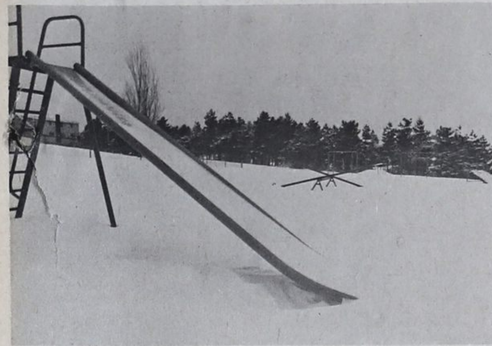
Site of summer improvements