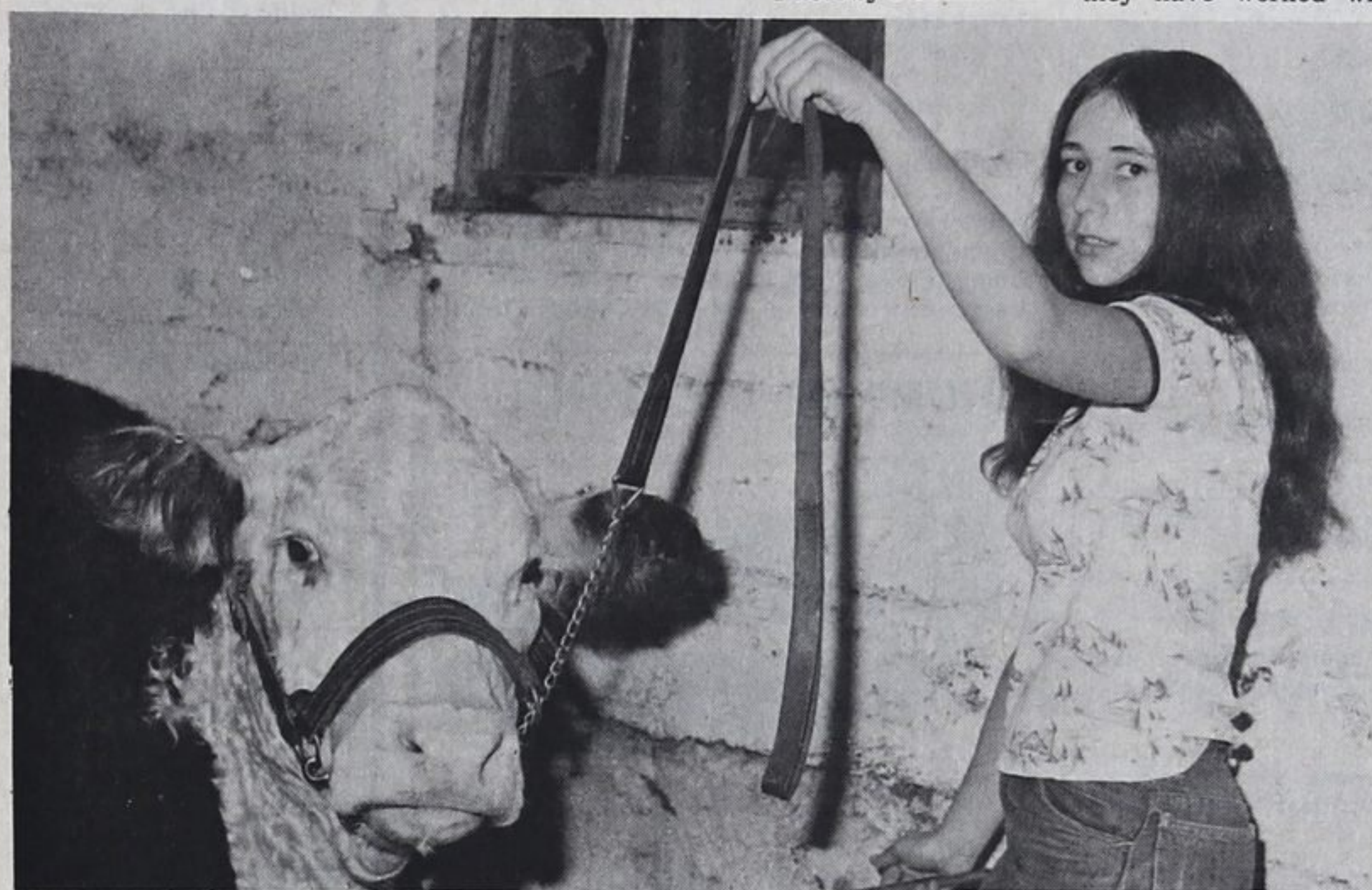
Starsky without Hutch