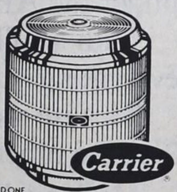
THE ROUND ONE

*To qualify for rebate, equipment must be installed and paid by Jan. 31, 1978. Rebate cheque will be mailed to you by Carrier as soon as transaction is completed.