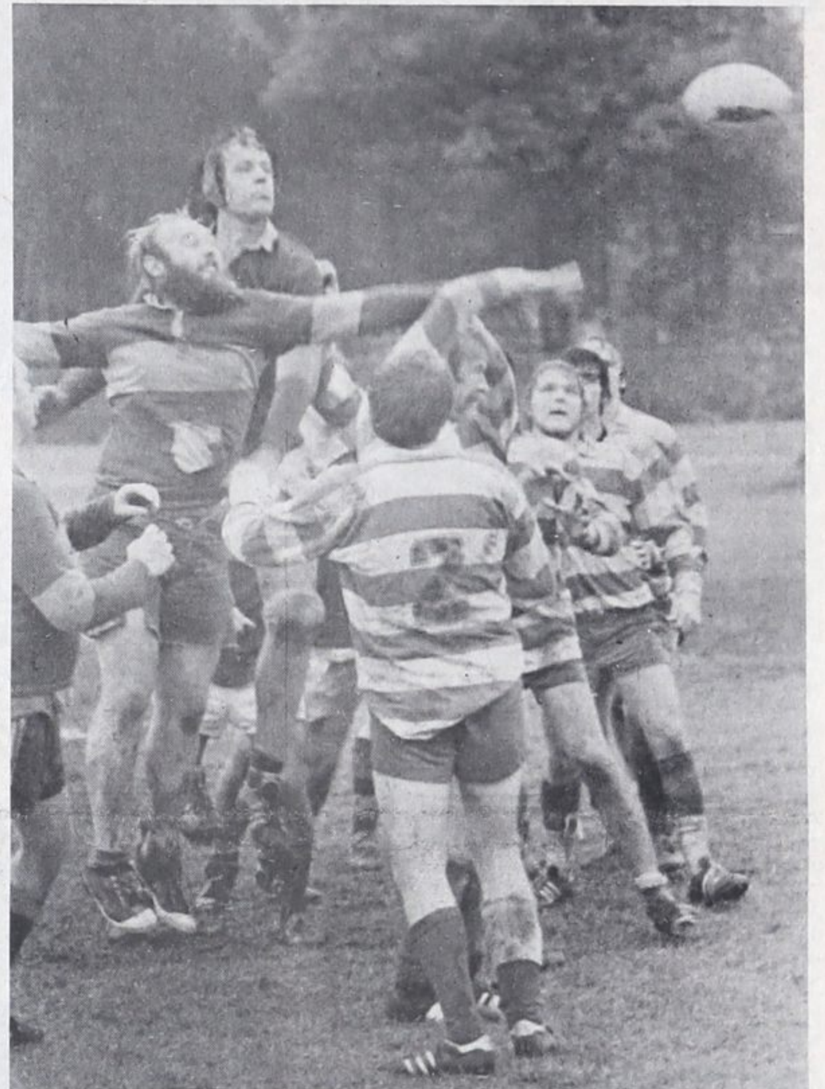
Up for grabs

Further practices will be held next week in Elmvale, as soon as the ice is in there.