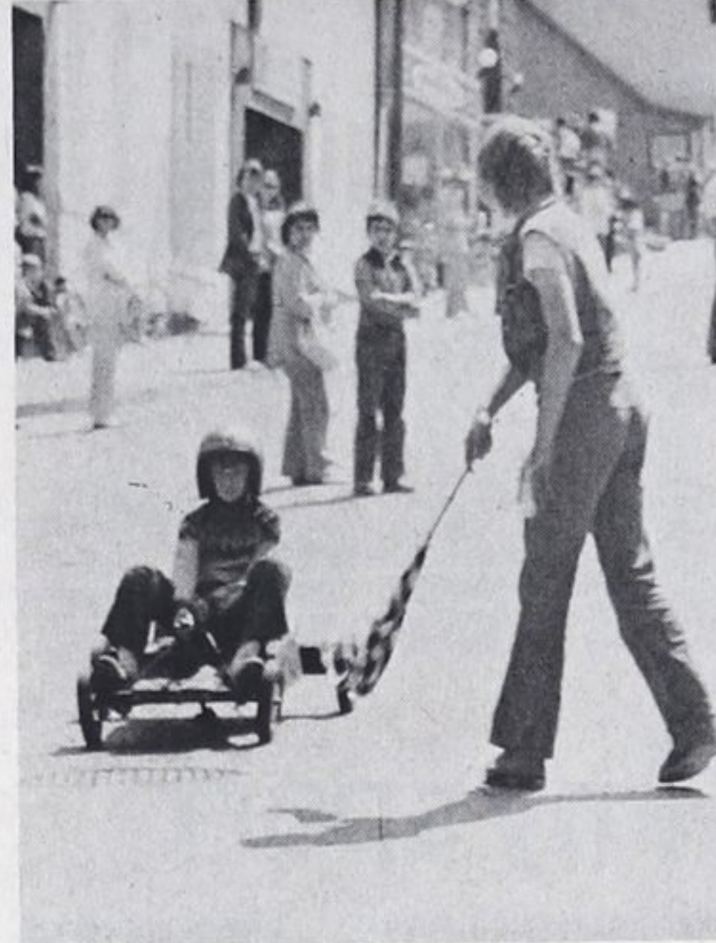
He's got the flag

The second half of the field of 52 entrants will have their chance for glory in Midland on the 27th of August starting at 1 p.m.