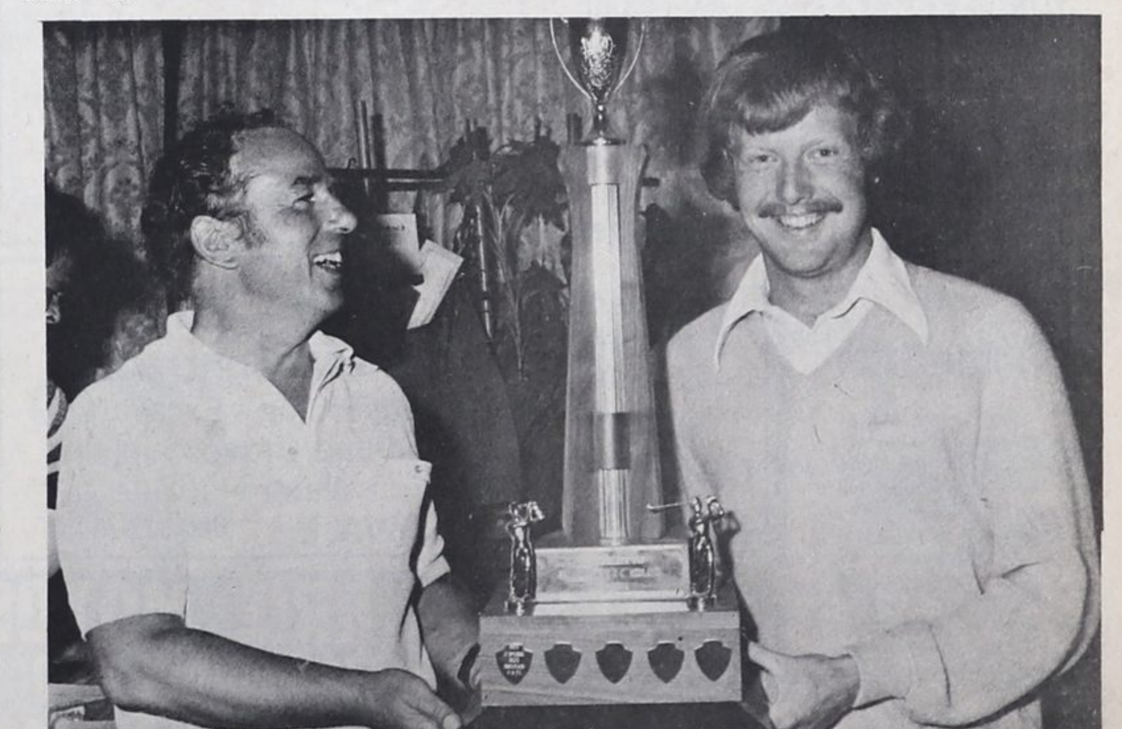
Walker Invitational trophy presentation

Annual Johnny Walker Invitational played at Brooklea Golf and Country Club.