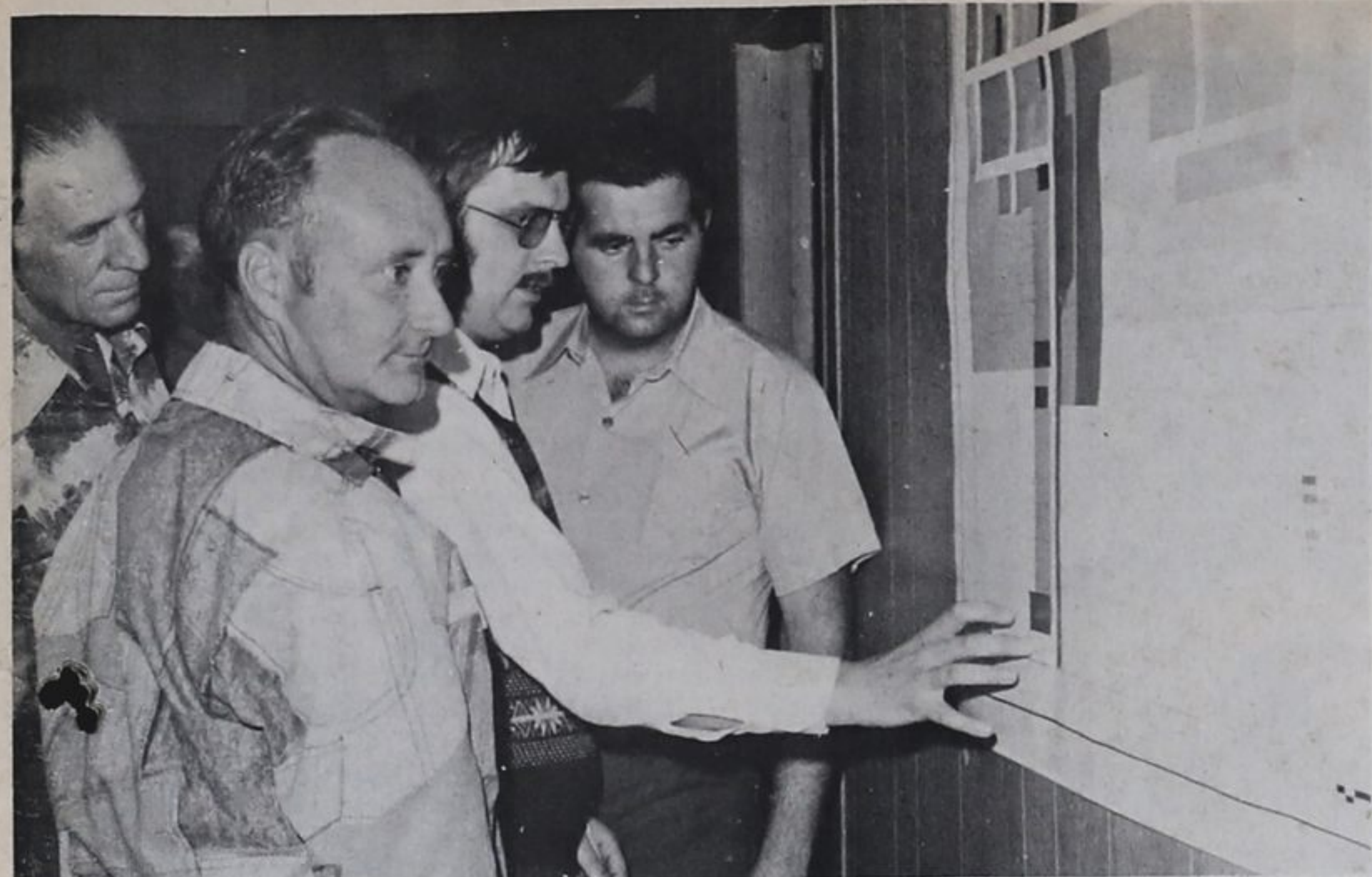
It was just an oversight

This possibility will be further investigated by the consultants preparing the recreation complex feasibility report.