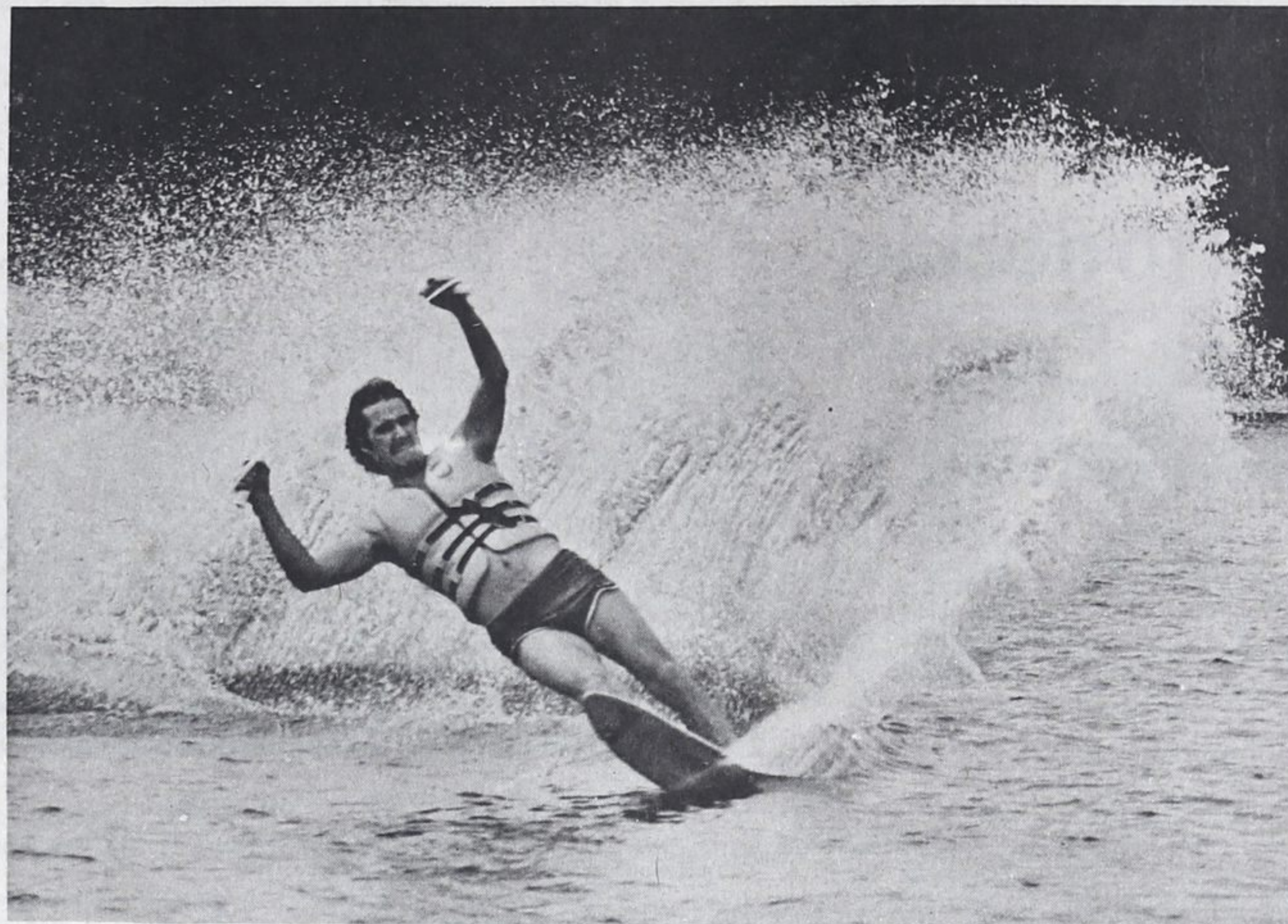
You should see what I can do on two skis