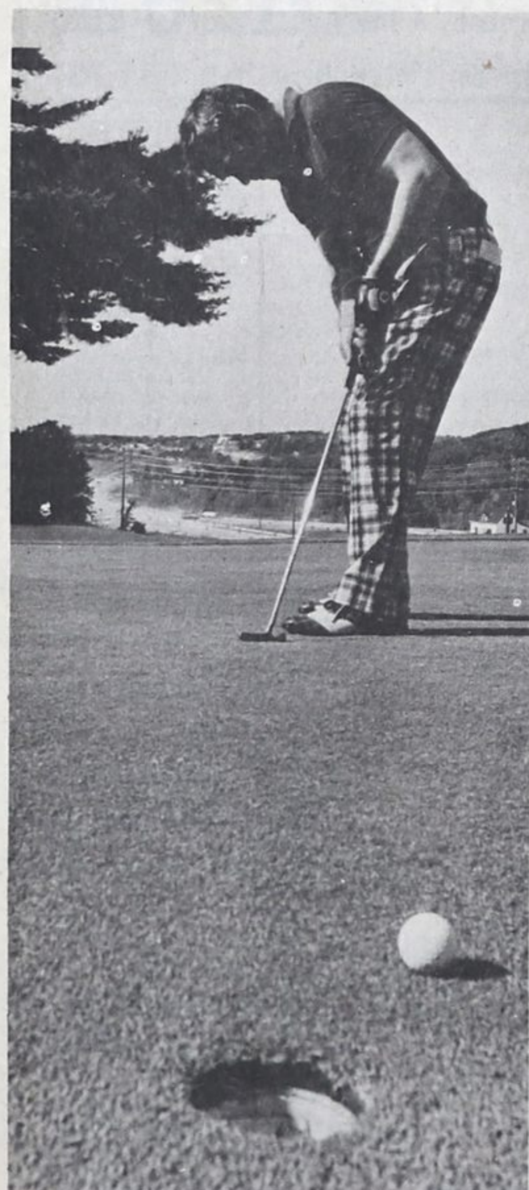
So o o close