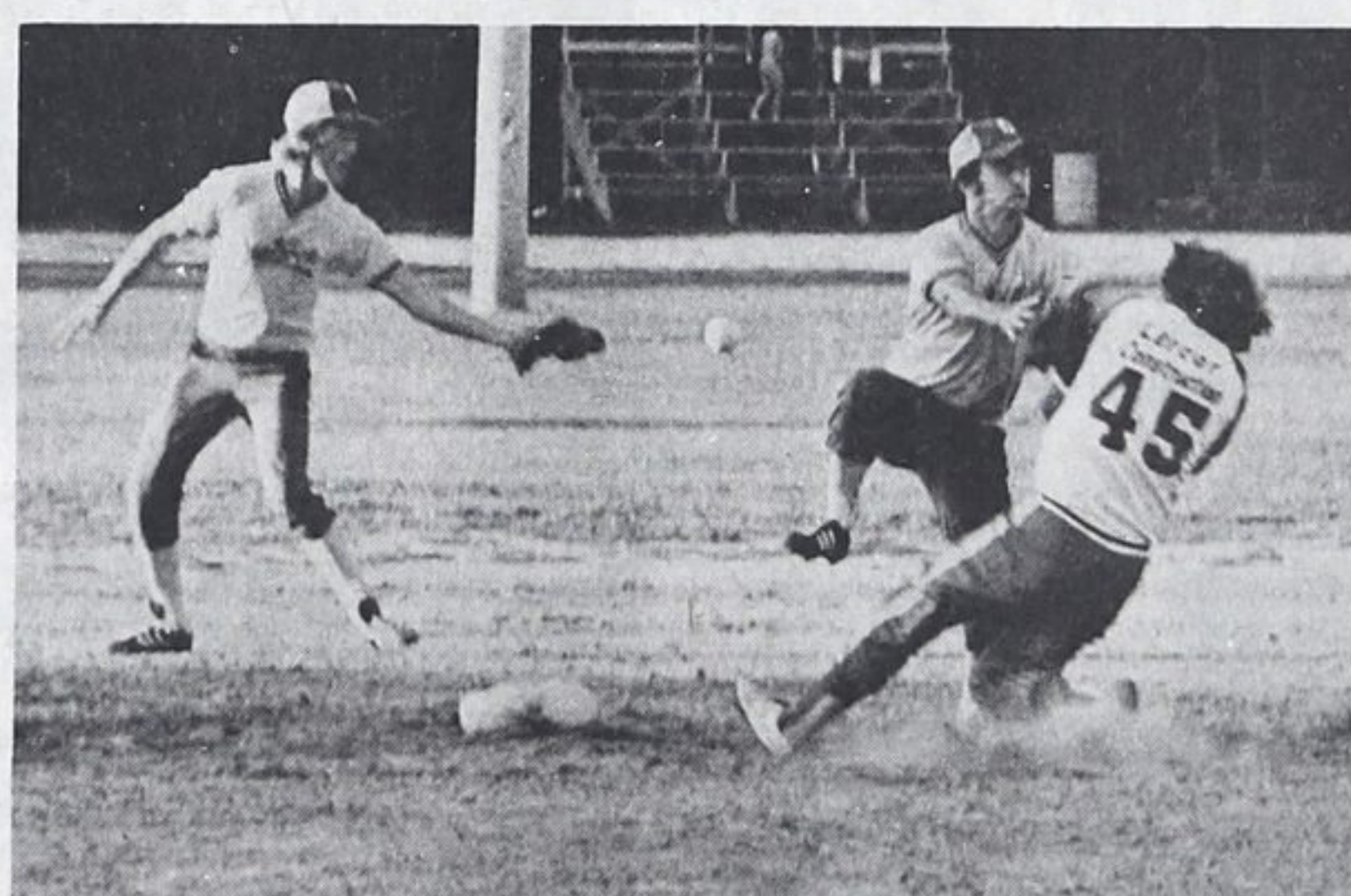
Whew - that was close