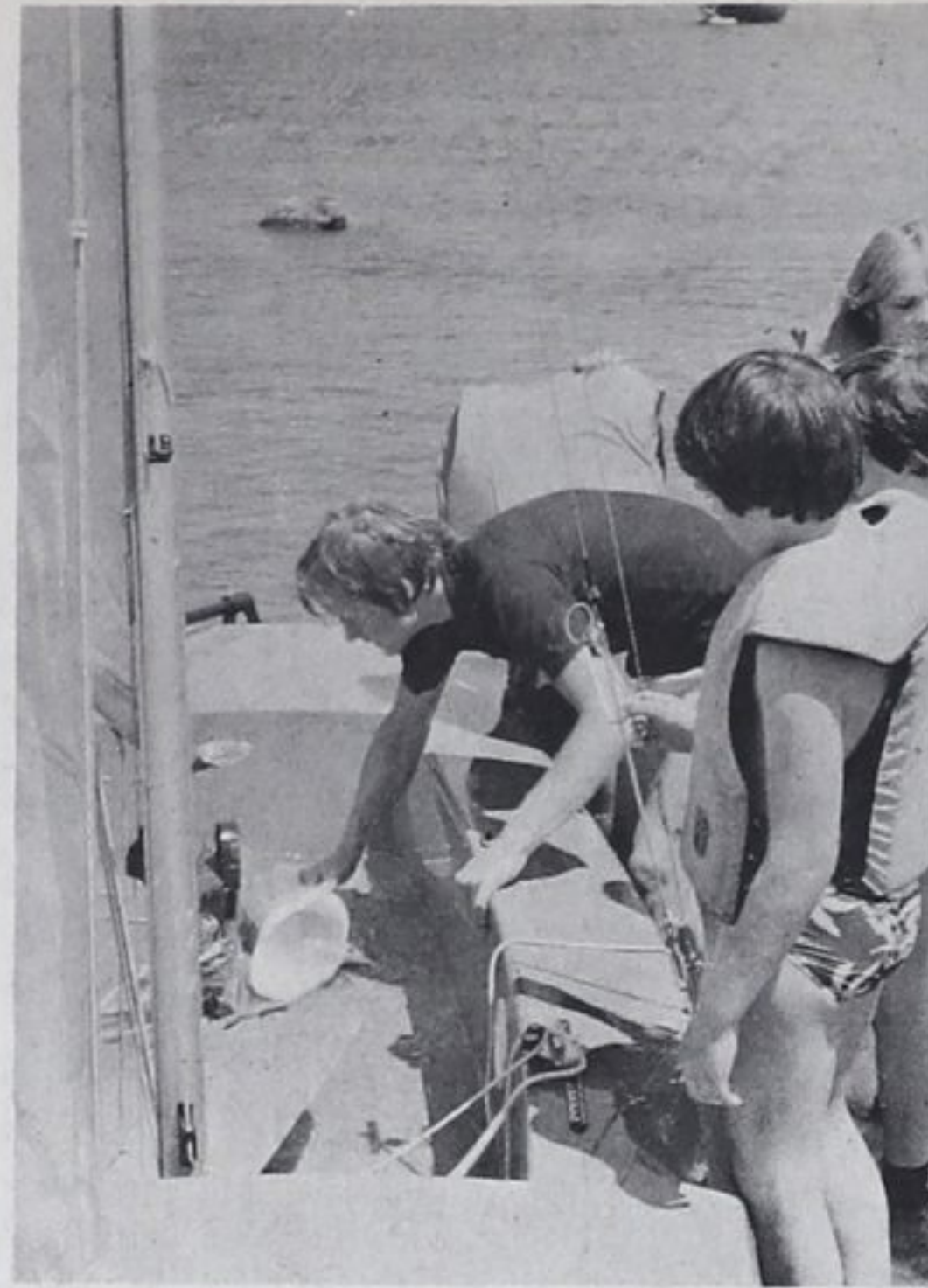
Time to bail out