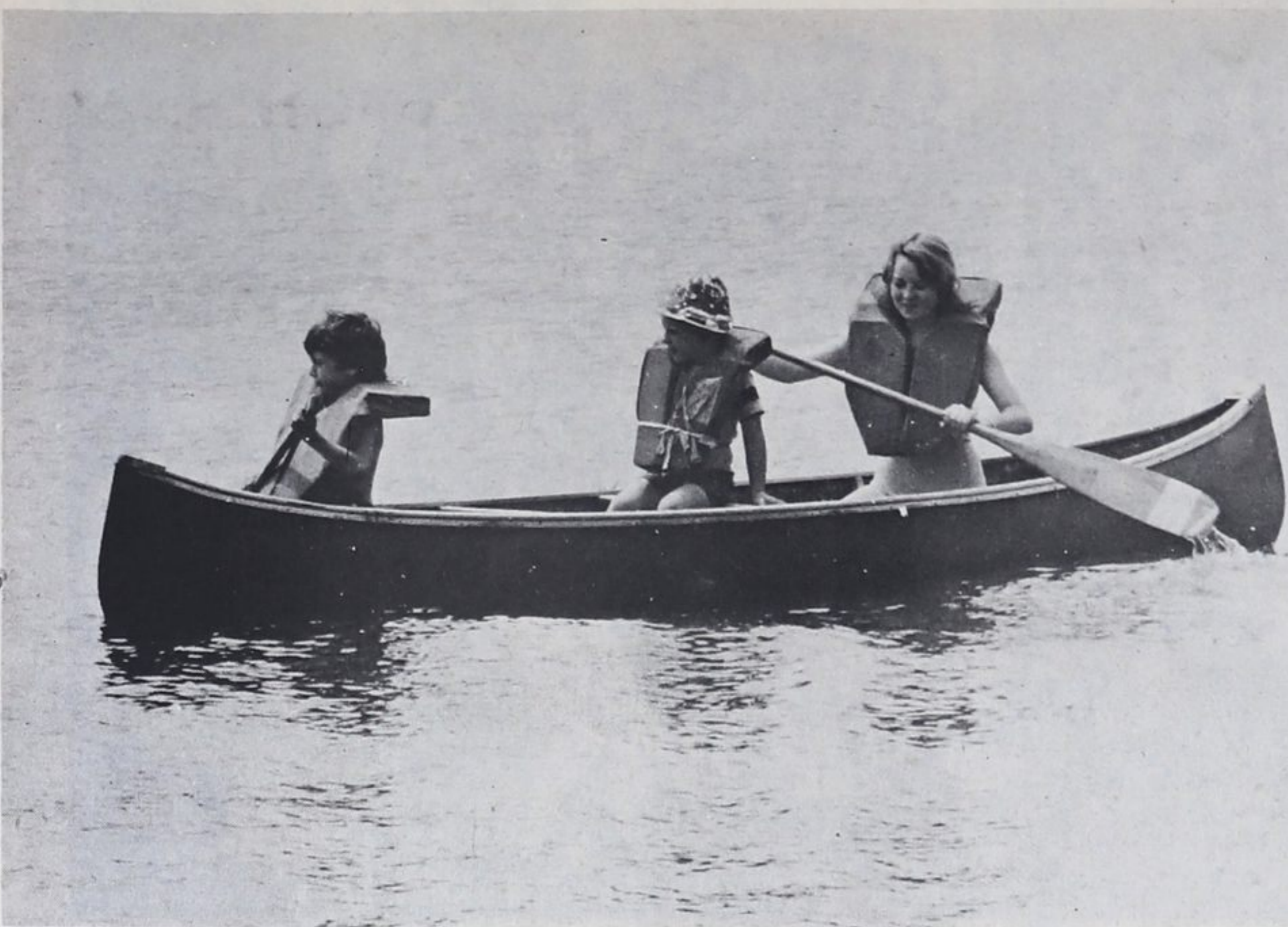
Canoeing in Penetanguishene Bay

Tay Township offices on August 4, and will probably be formally accepted by the board at its next regular meeting, on September 1.