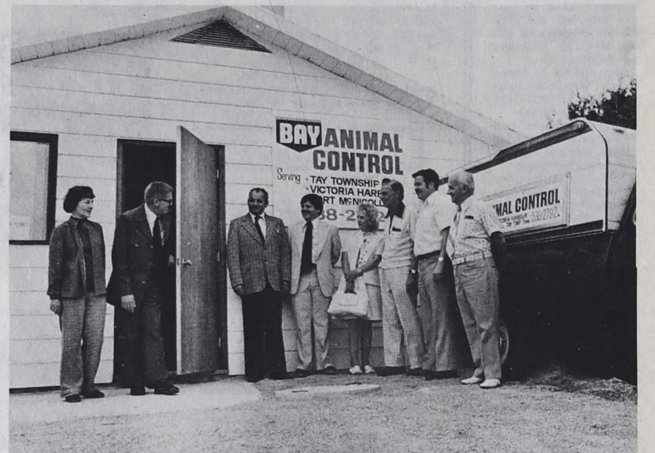
New animal shelter

(b) Notwithstanding the provisions of sub-section (a) of Section numbered 18, or the provisions of Section numbered 6 of this by-law, any person may, upon presentation of the violation tag issued pursuant to this by-law alleging commission of an offence under this by-law pay out of Court within five (5) days from the date of issue of this said tag (exclusive of Saturday, Sunday and holidays), the sum of $10.00 and upon such payment, no further proceedings are to be taken under this by-law in respect of the said offence alleged in the violation tag.