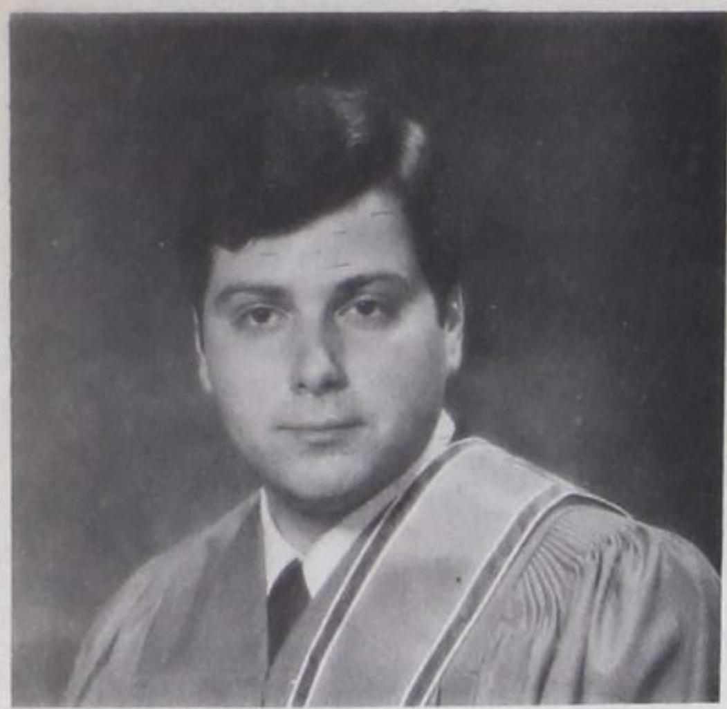
Georgian College grad