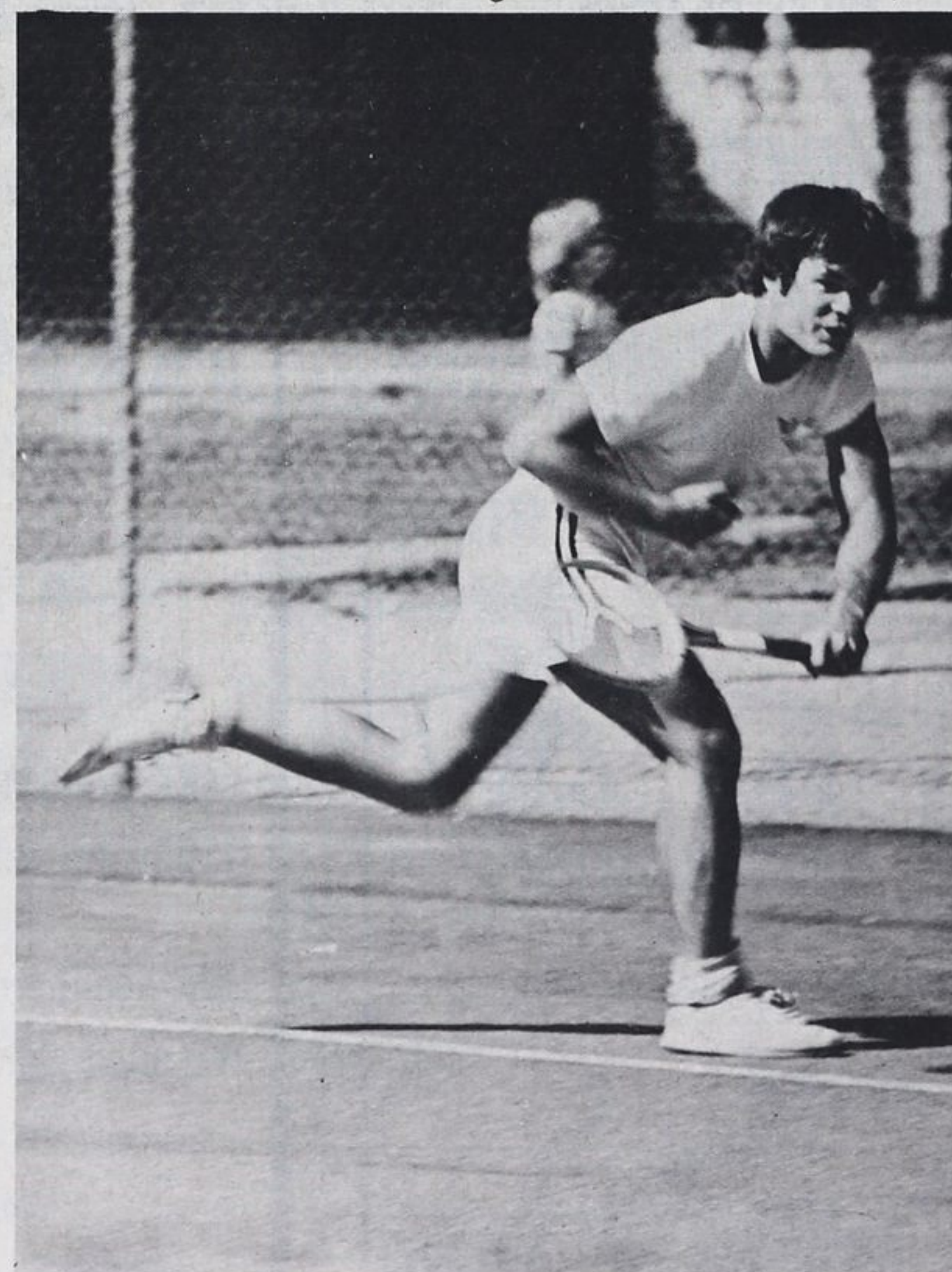
There were a lot of milkshakes riding on this match