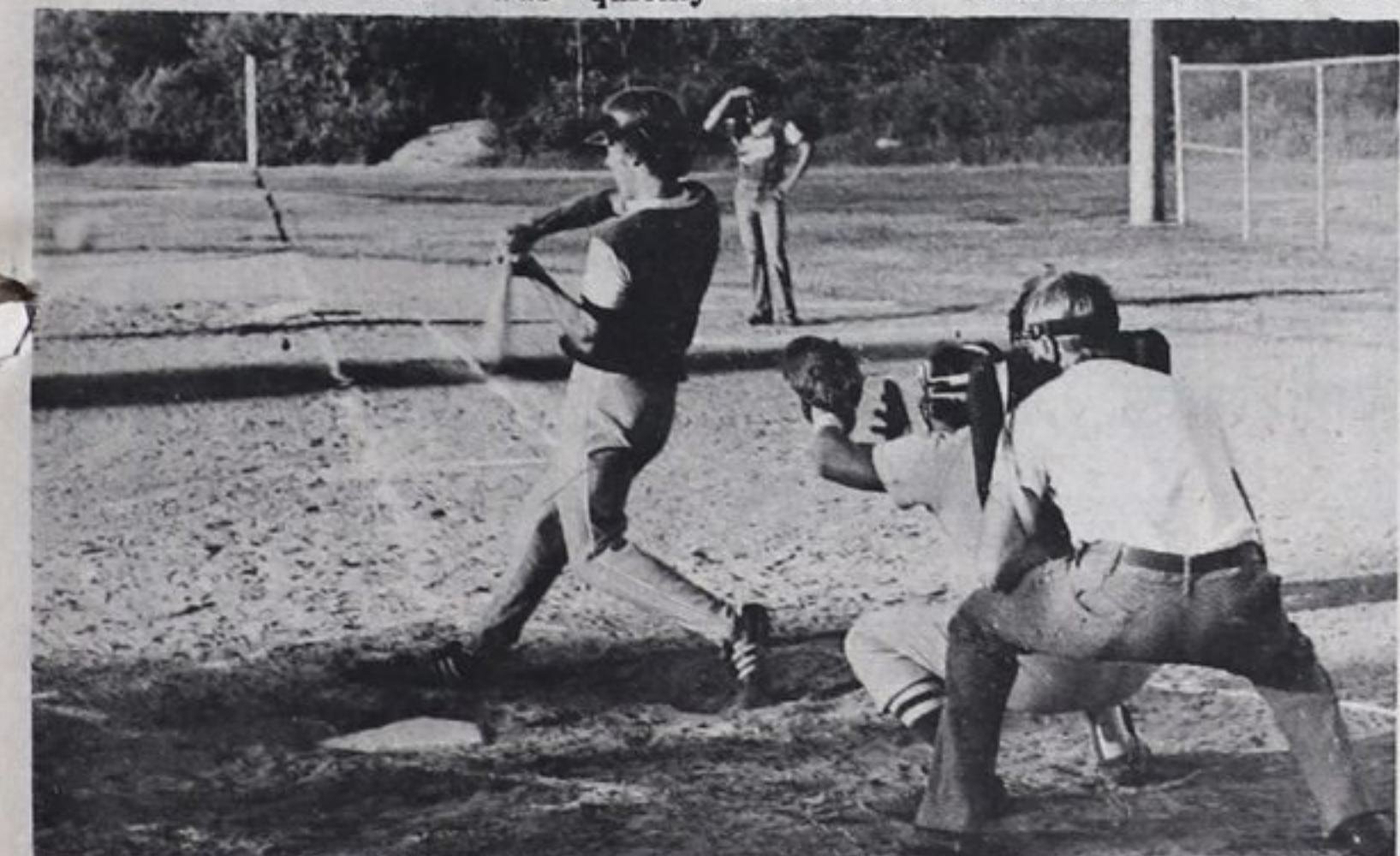
Take it batter

The Midland fastball team was in Penetanguishene Sunday night playing Ken's Esso in Georgian Bay fastball action. Ken's Esso won the game with a score of 8-6.