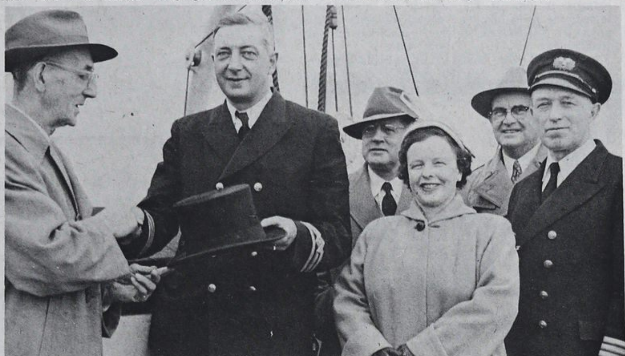
In days gone by

And even if they did, it's doubtful that any modern ship could sail the Lakes with the aplomb of those two White Sisters from Port McNicoll - the Assinboia and the Keewatin.