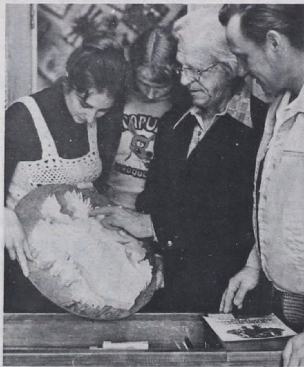
Lost crest re-made

This year approximately 30 students and 27 firms or professional offices will be participating.