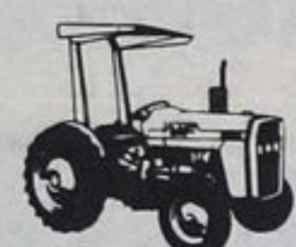
MF 230 Tractor