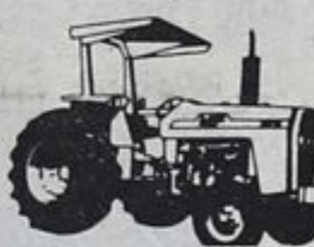
MF 184-4 Tractor 4wd.

We've got Spring Fever prices on all new MF farm tractors under 80 pto hp. Spring into action and save!