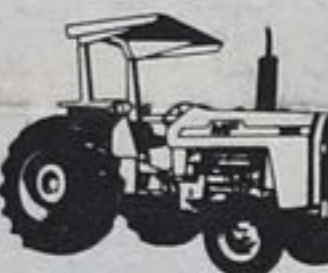
MF 255 Tractor