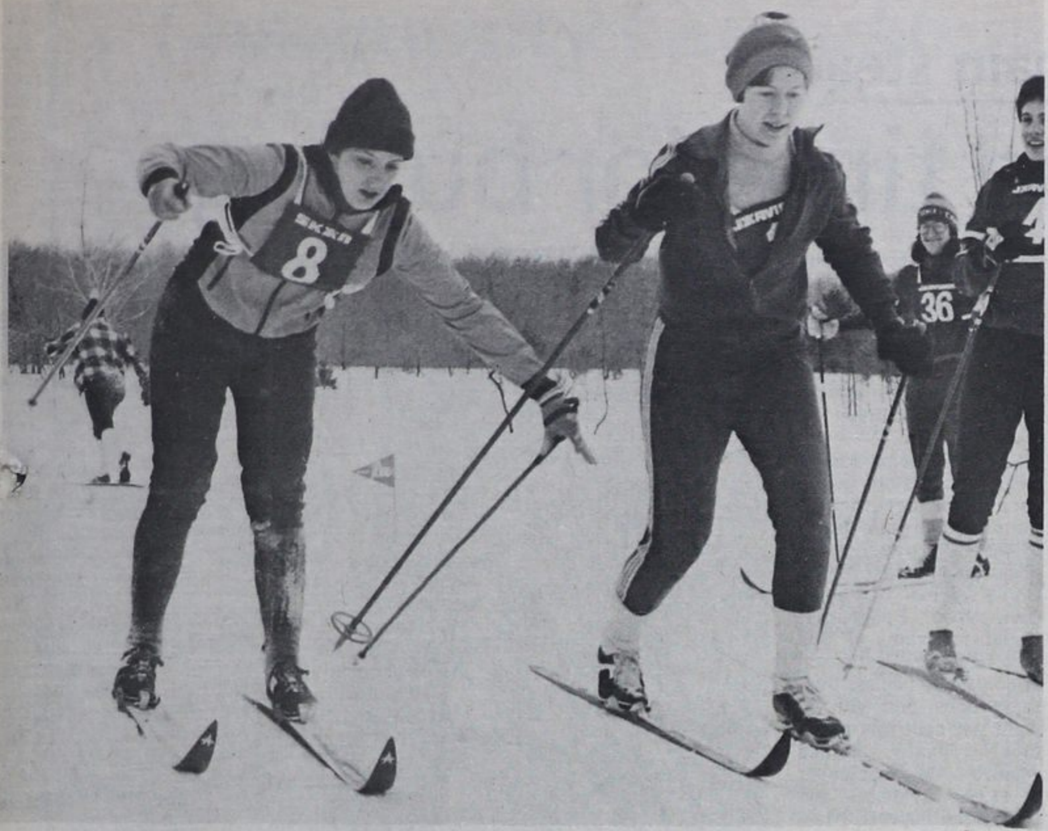
Before the fall

Making contact with fellow relay racers proved to be hazardous as this skier took a fall shortly after sending her teammate off on a loop off the Mountain View cross-country course. Eleven Universities competed on Friday and Saturday in the All-Ontario University Races. Midland skiers fared well in the Bracebridge