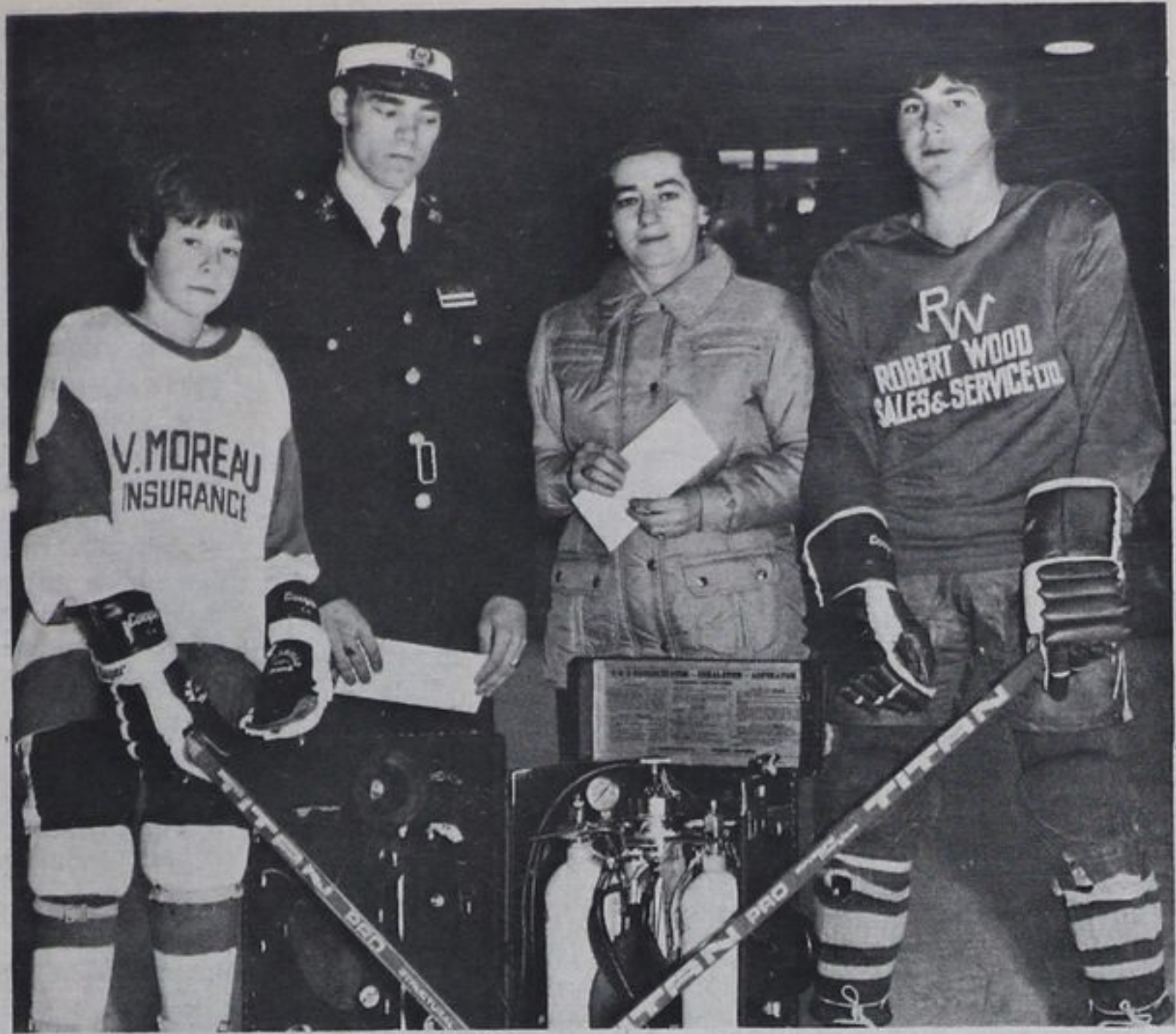
Little NHL says thank you