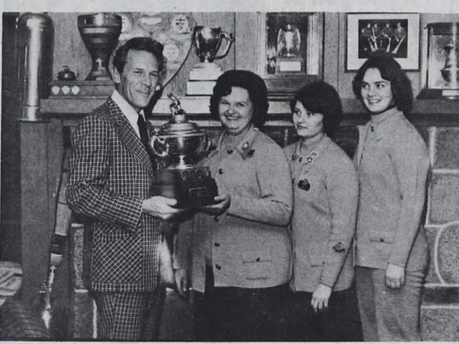
'Filly' bonspiel winners