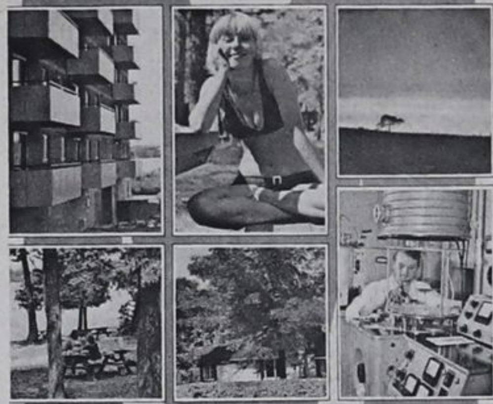
A Pictorial Presentation