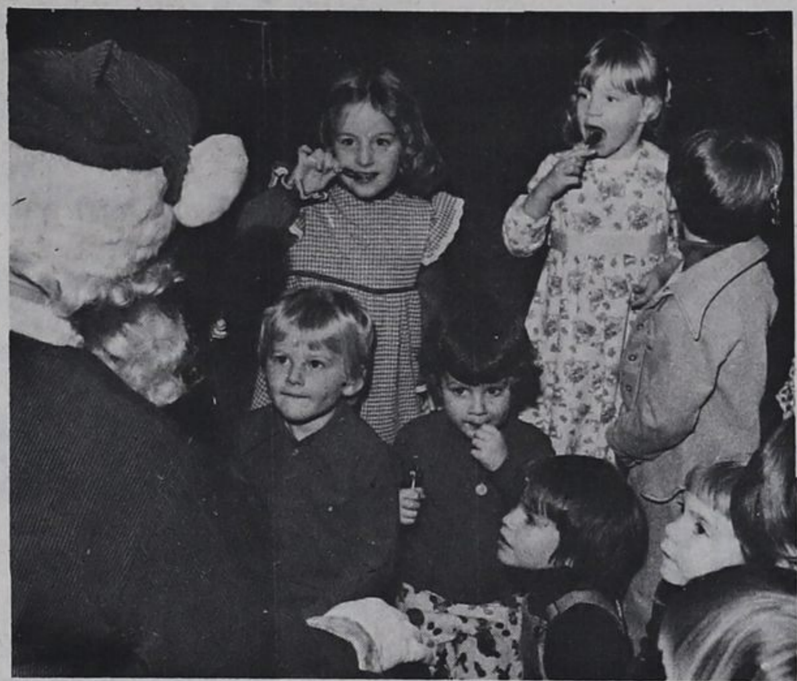
Is it really Him?

Judging by the gusto and dedication of this Santa Claus a few more generations' faith in Santa will be kept intact.