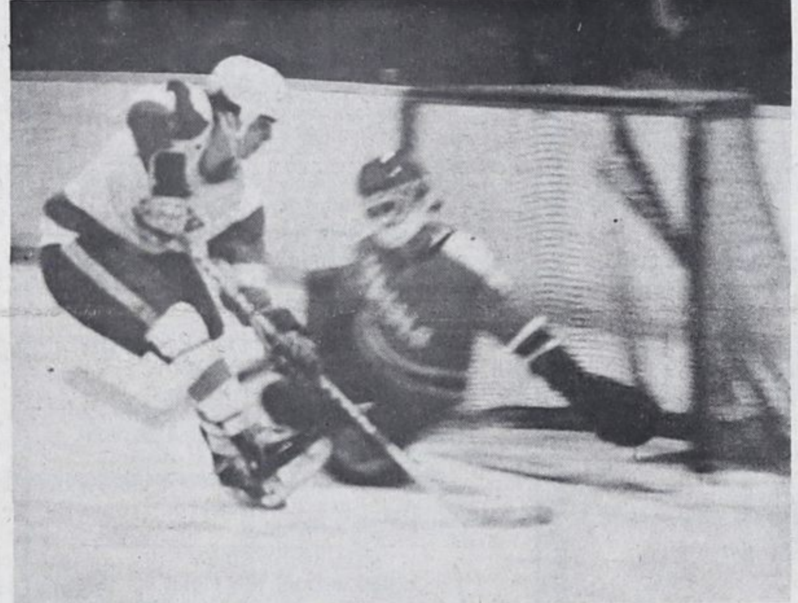
Steaming in for the shot