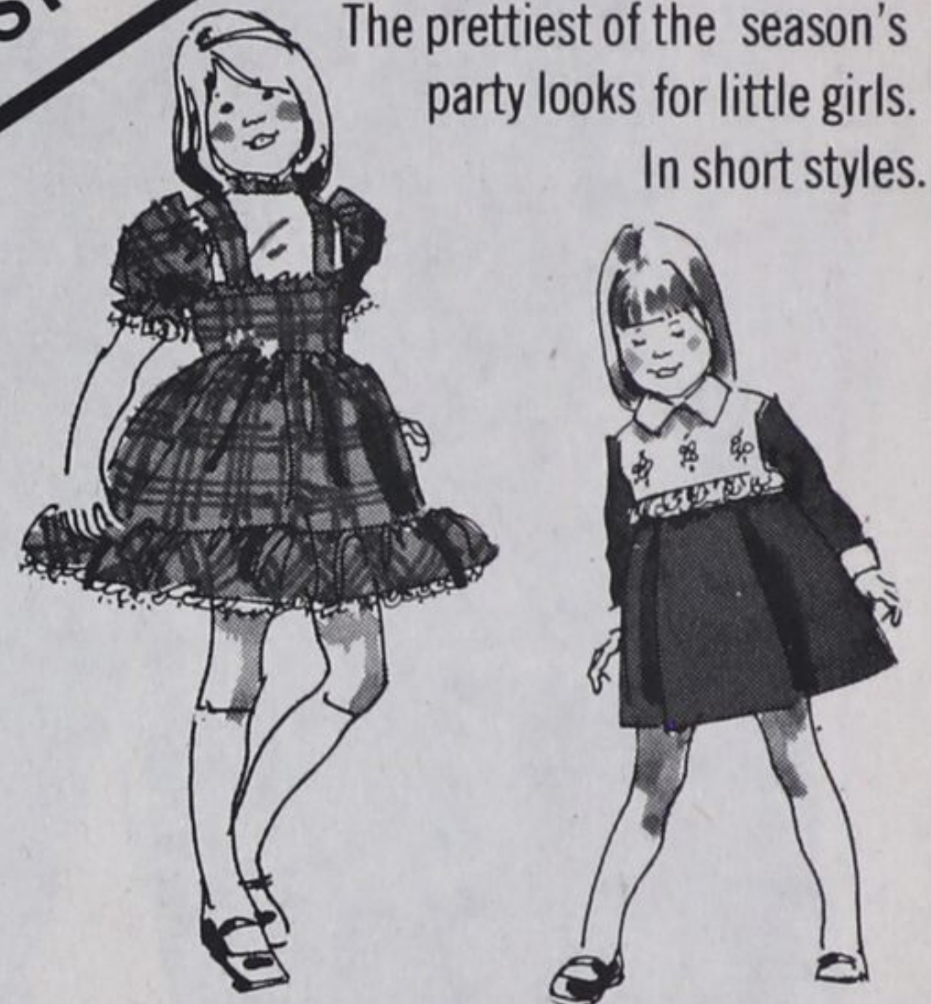
Dresses, sizes 6 months - 24 months, lace and embroidery trimmed fancy dresses in plains and prints in assorted colours from $8.25 and up. Ideal for those dress-up occasions. 2-3X, from $11.50 and up, quilted and lace trimming on party dresses, assorted colours and styles, to give that feminine little touch for any occasion or "happening".

The prettiest of the season's party looks for little girls. In short styles.