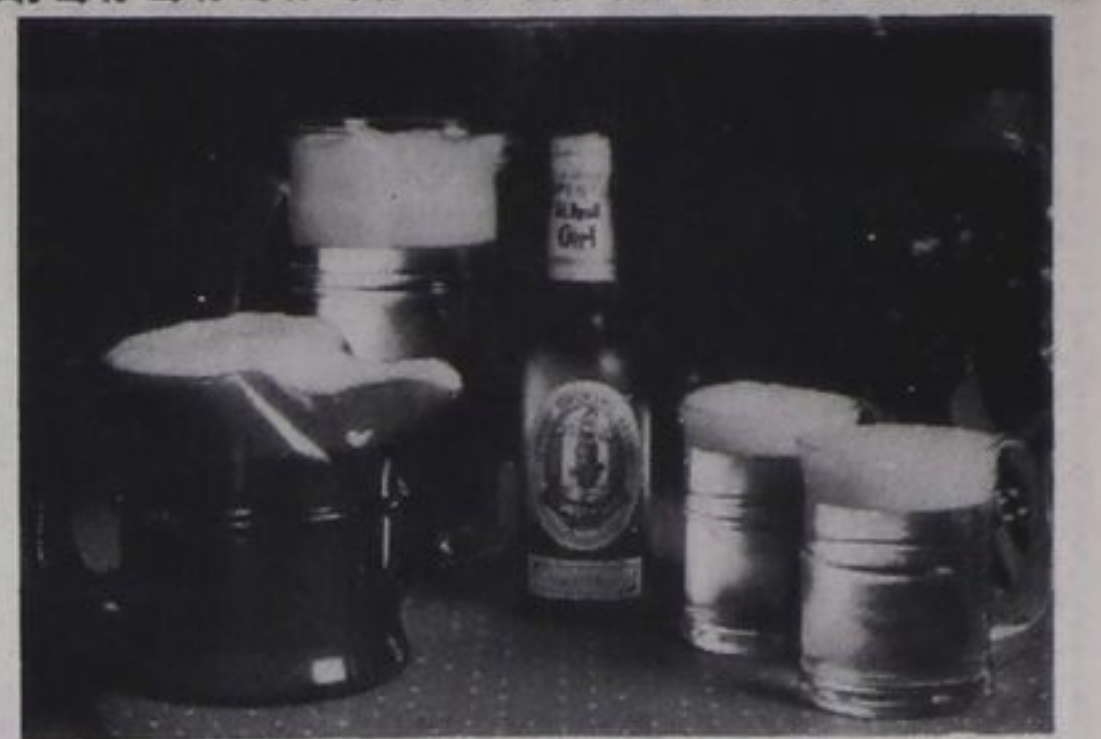
A CHRISTMAS GIFT FOR HIM that's sure to be appreciated is a pair of chic, clean-looking crystal beer mugs with one of these matching pitchers from Hadeland of Norway. To really make the man's Christmas complete, top off the gift with something he rarely buys himself: a case of light, tasty St. Pauli Girl Beer from Germany.

be a good selection, in part because it's suitably exotic. The brew enjoys immense popularity in such far-flung areas as Alaska, the Bahamas, Bermuda, and much of the U.S., but has the most frequently requested characteristics of imported beer. It combines a light, clean, natural taste, and proper aging without chemical preservatives.