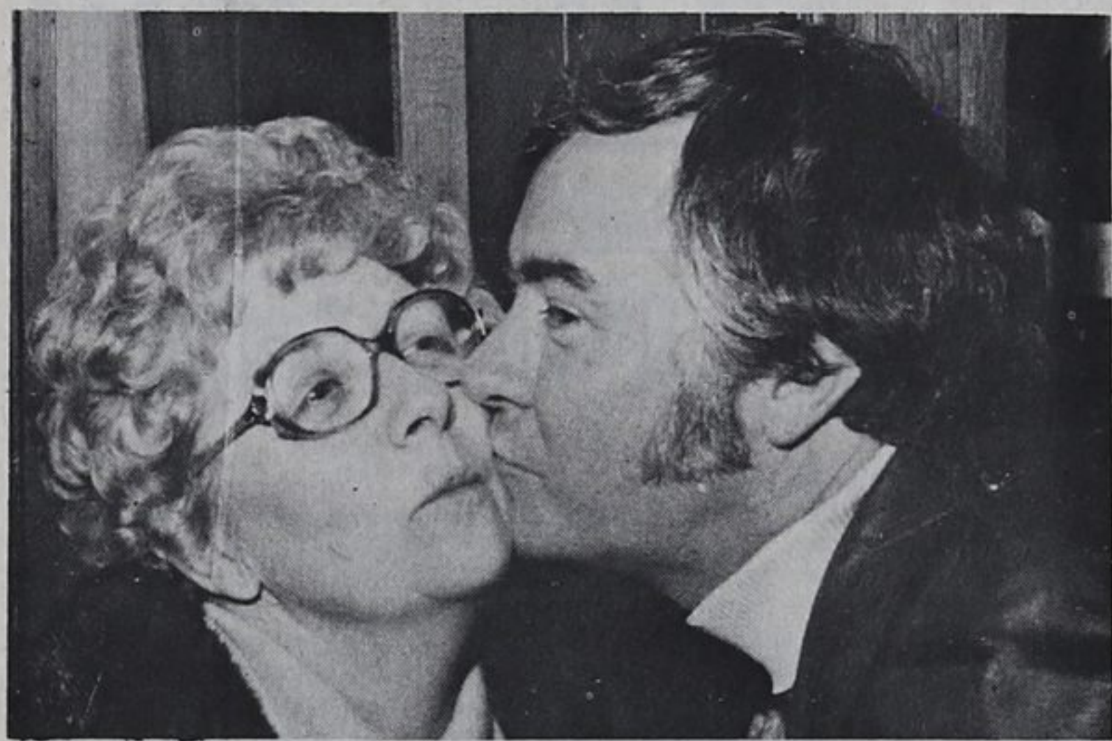
How sweet it is

An astonishing 49 per cent turned up at the polls to mark in those critical X's. The weather was perfect - a candidate's dream. Around town the liveliest spot early in the