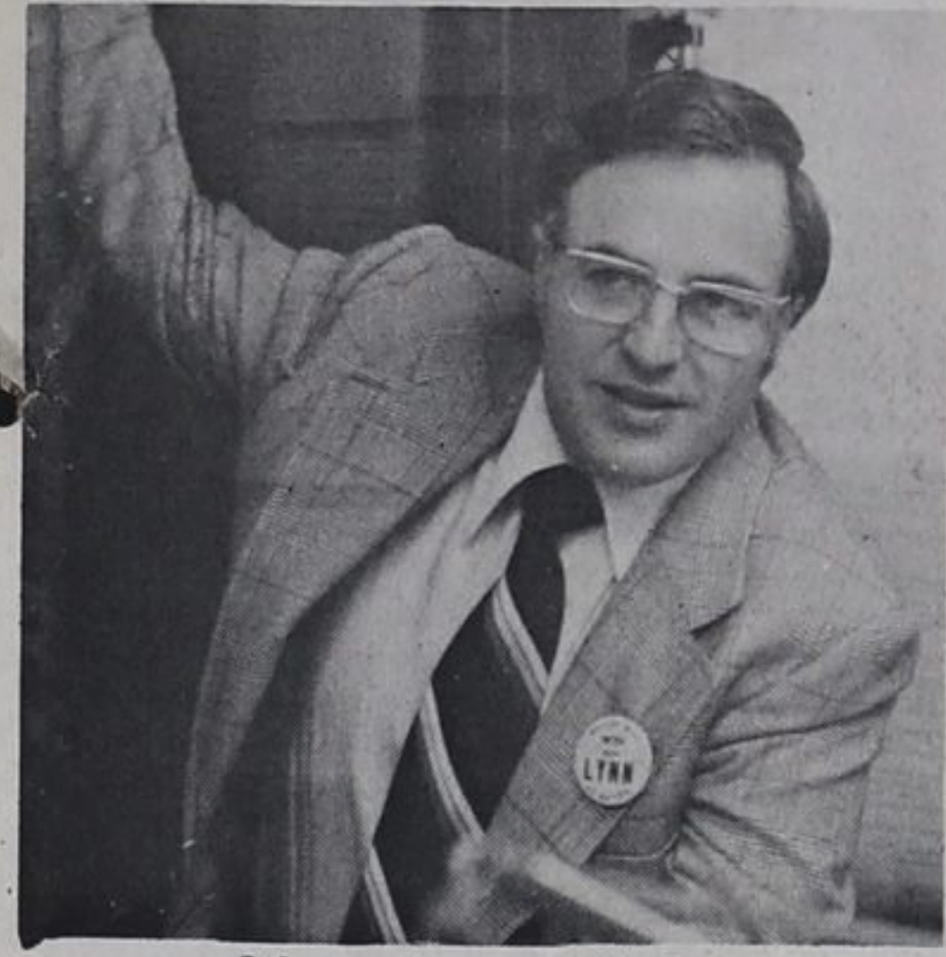
Now hear this This is your mayor speaking