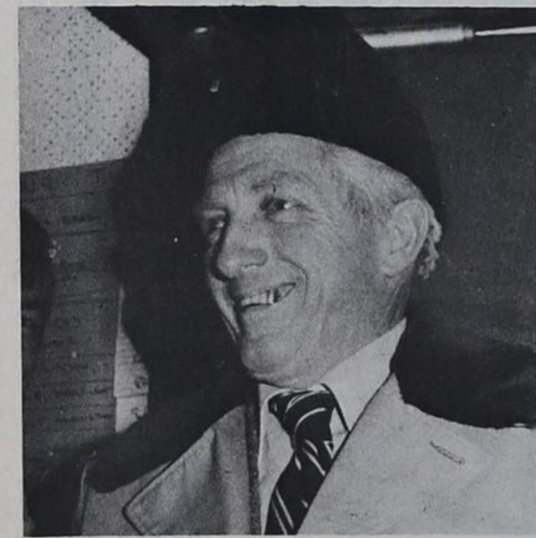
Stiff upper lip