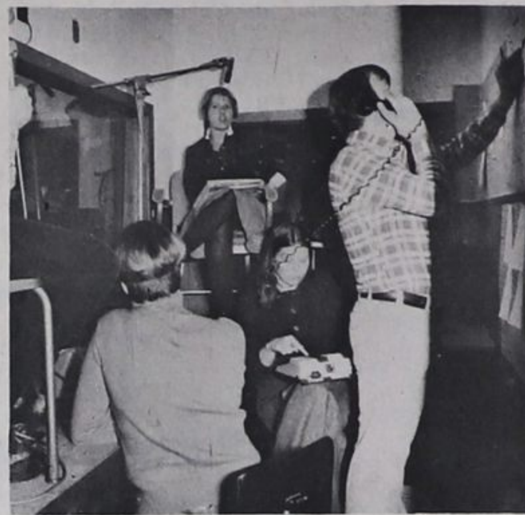
Election central - where the action was