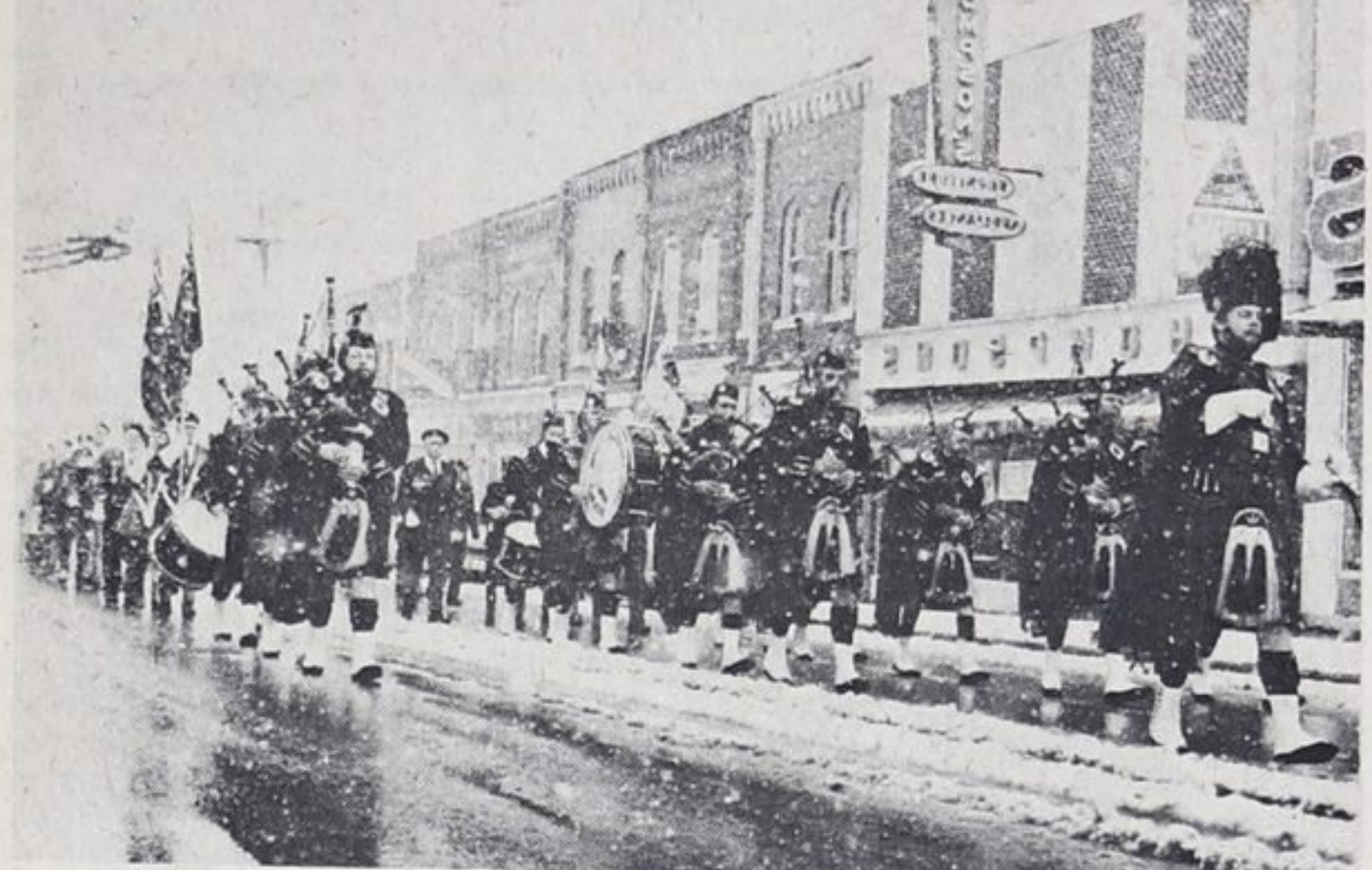
Remembrance Day parades in Midland...