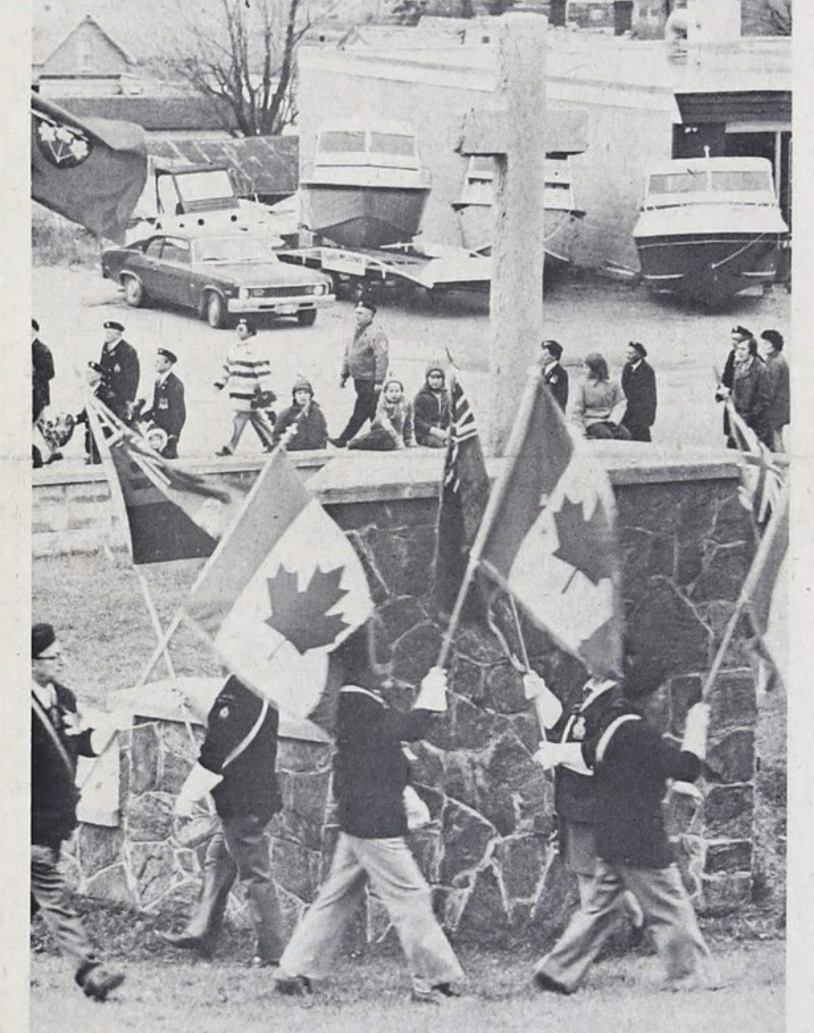
...and Port McNicoll help us remember...