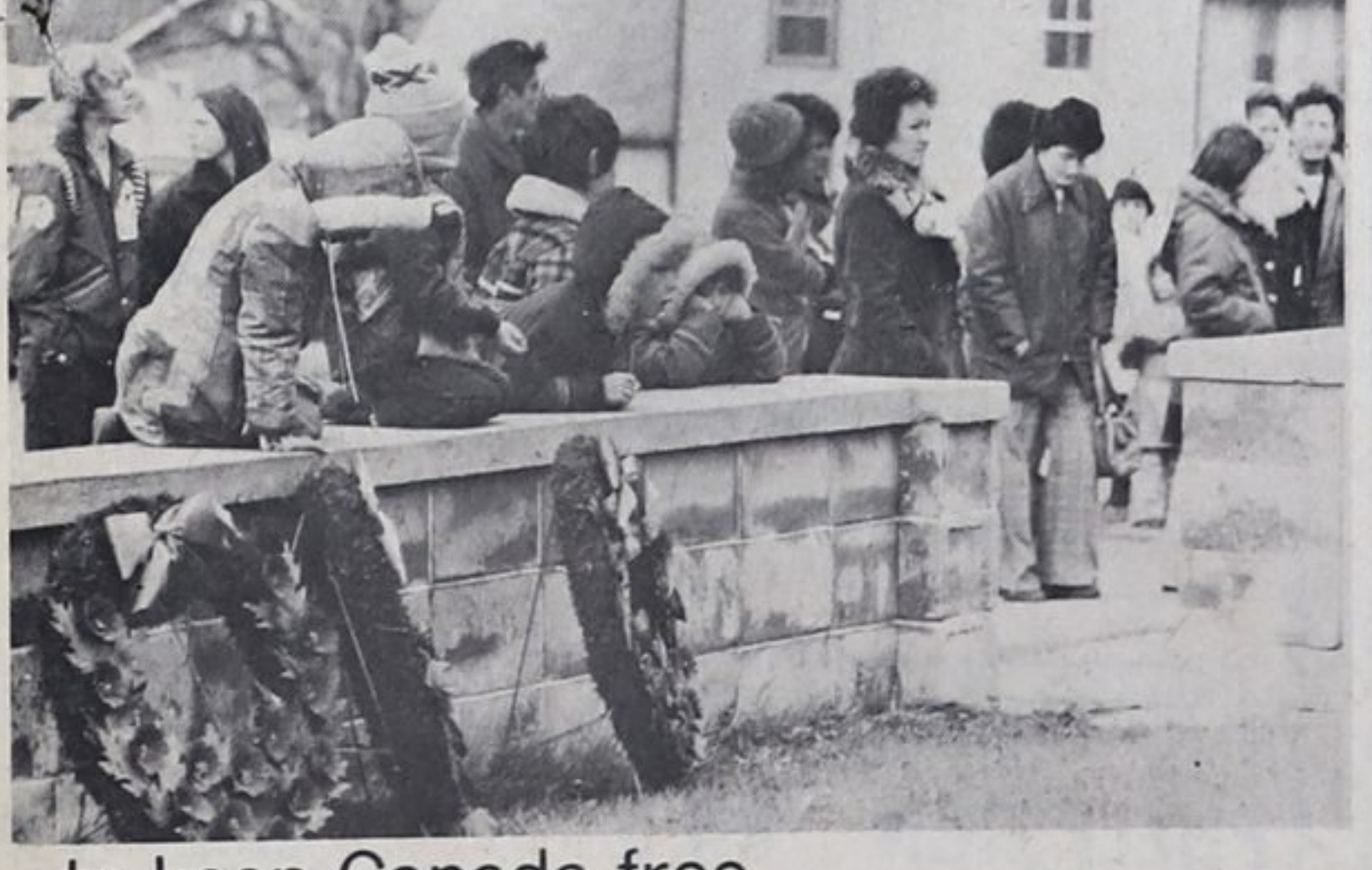
...to keep Canada free.