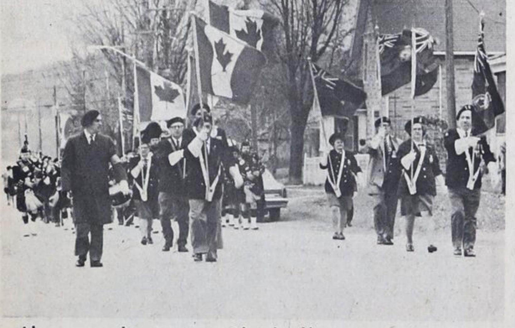
...those who gave their lives...