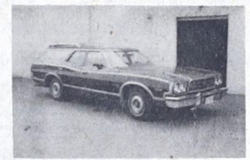
1973 Gran Torino Squire Wagon Power equipped with luxury wood panelling and luggage rack. Only 47,000 miles. Lic. HCZ 878