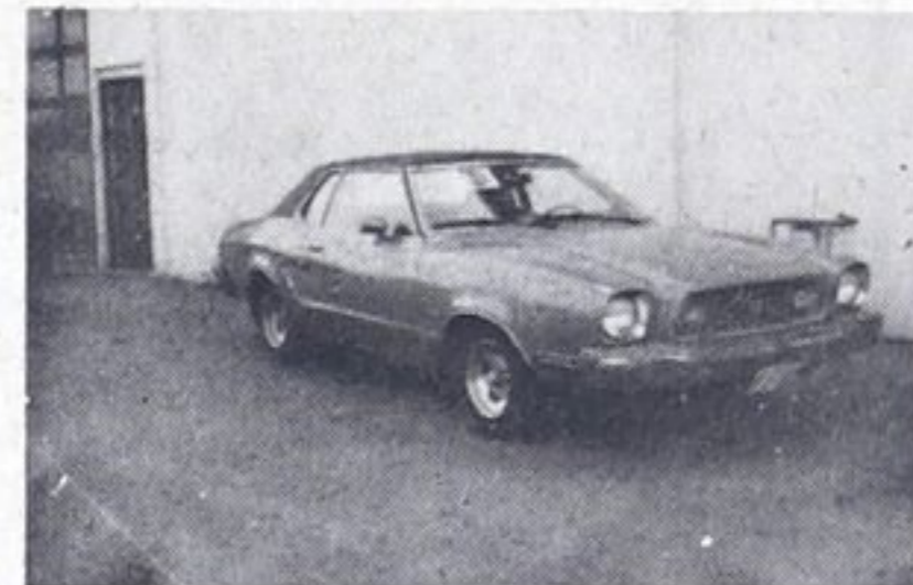
1974 Mustang 2 door Htp. 4 cyl., standard, mag. wheel & radial tires, green Lic. HFJ 143 26,000 miles