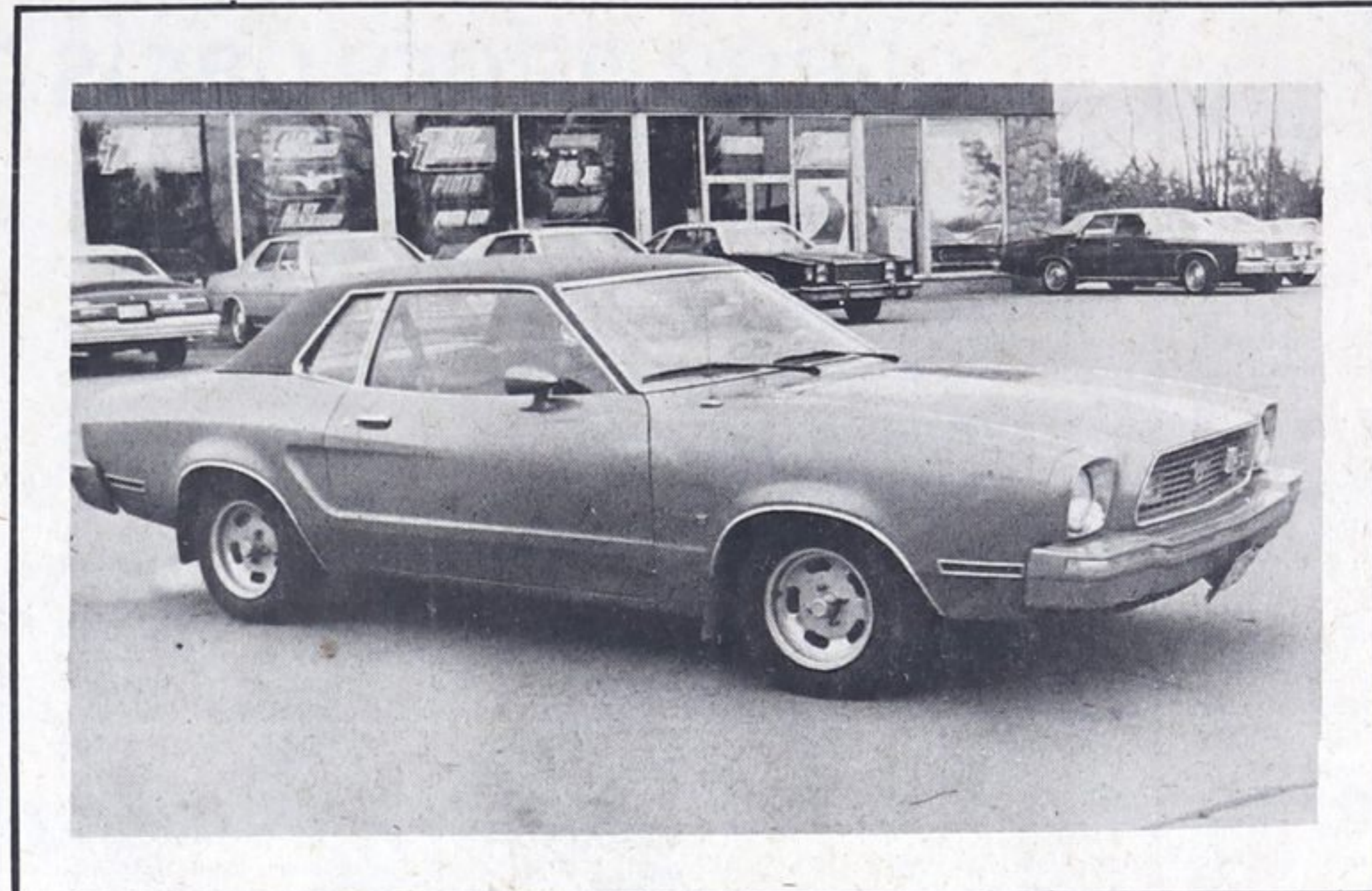
1974 Mustang Coupe 4 cylinder, 4 speed transmission, radial tires, mag. wheels, radio, bucket seats, vinyl roof, 26,000 miles. Lic. HFJ 143