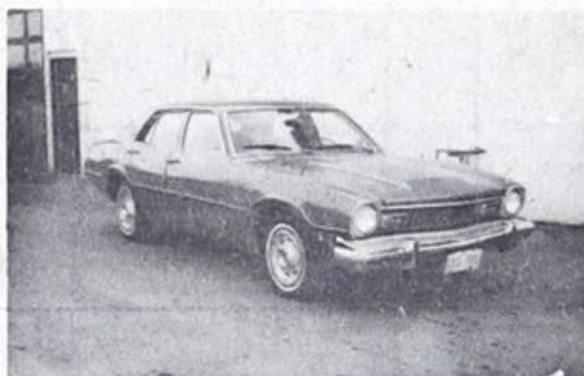
1973 Maverick 4 door, 6 cyl., automatic Lic. FKS 701 50,000 miles