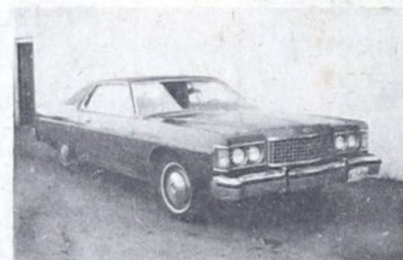
1973 Meteor Rideau 500 2 door htp., V8 power steering & brakes, brown Lic. HCZ 936 27,000 miles