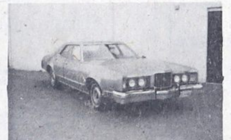
1972 Montego 4 door sedan, very similar to our 1973 model, also in blue with same mileage. Lic. BPN 390