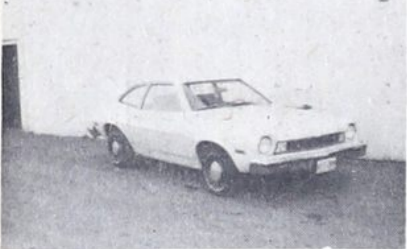
1975 Pinto 3 door runabout, 4 cyl., automatic, blue, Lic. KFT 209 only 9,000 miles