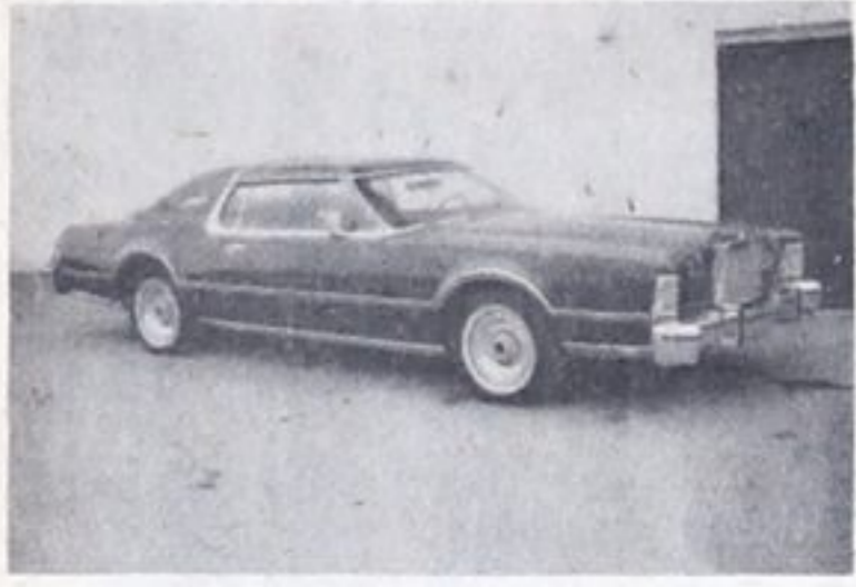
1976 Lincoln MK IV 2 door hardtop, black starfire luxury group. Only 6,000 miles with warranty remaining. Lic. LDA 721