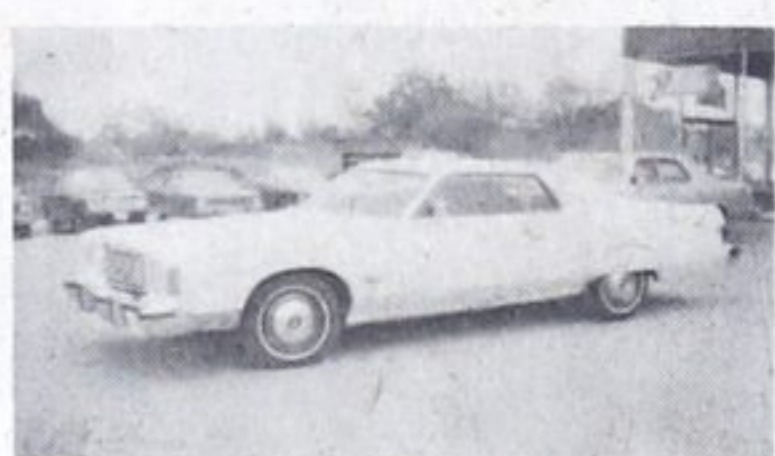
1976 Mercury Marquis 2 door hardtop, air, AM/FM stereo, windows, tilt wheel, radials. 5,500 miles. Lic. LCW 462