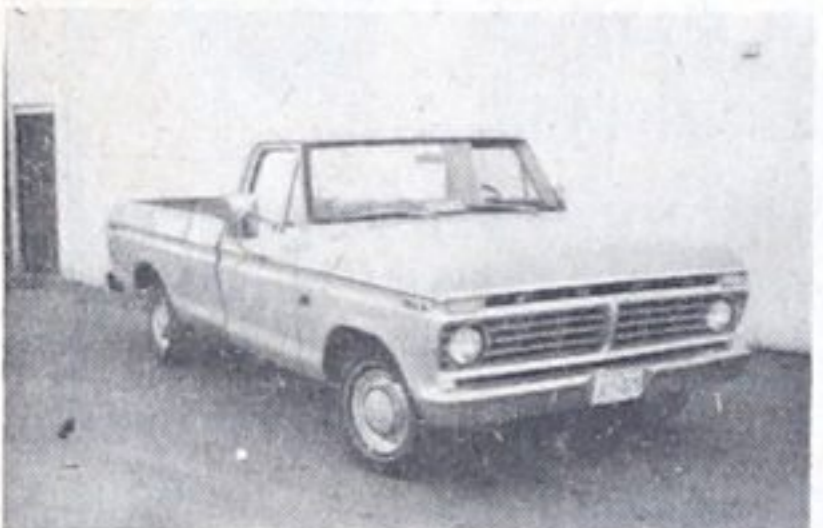
1973 F100 Pickup V8 standard, radial tires, cream colour Lic. J27 325 36,000 miles