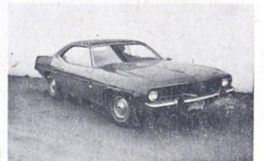
1974 Baracuda 2 door Htp., bucket seats, power steering & brakes, red, Lic. HFT 738 34,000 miles