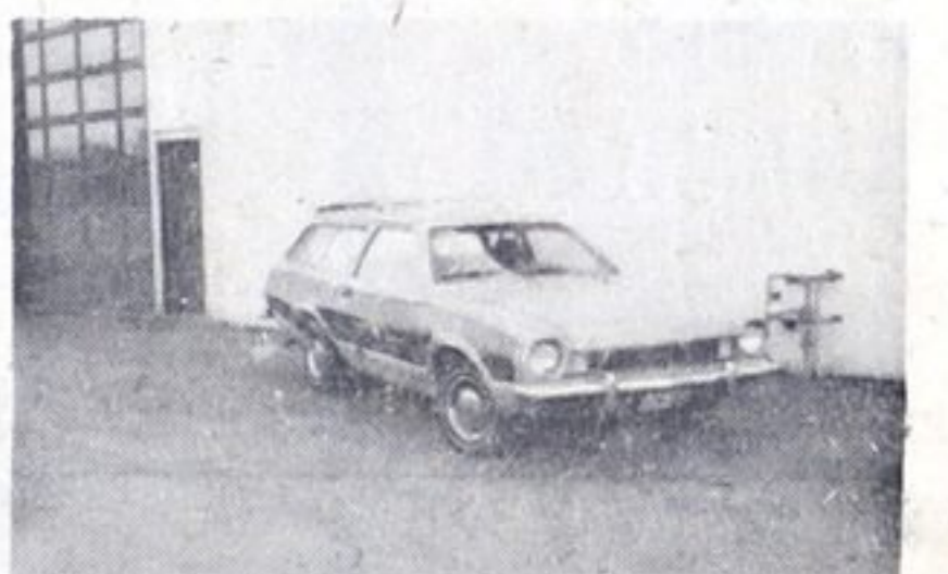
1973 Pinto Squire Wagon 4 cyl., std., radio & radial tires, beige Lic. HCH 384 49,000 miles