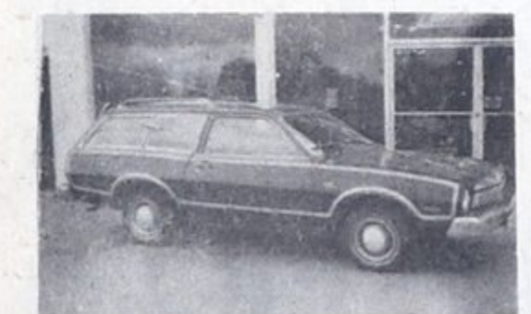
1975 Pinto Squire 4 cylinder automatic, only 8,000 miles, dark red & wood grain panels. Lic. HUC 452