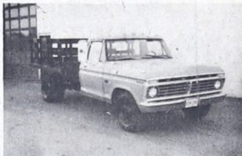
1974 Ford F 350 Chassis & cab, 9 ft. platform automatic transmission, blue 38,000 miles Lic. H28 280