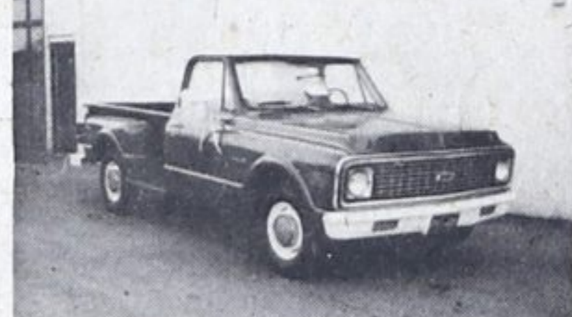
1971 Chevrolet Step Side Pickup 6 cylinder, standard, gold & brown Lic. P81 485 81,000 miles