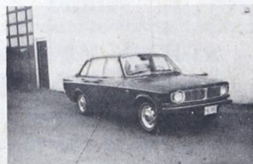
1969 Volvo 4 door automatic, radio, red Lic. FKL 341 55,000 miles