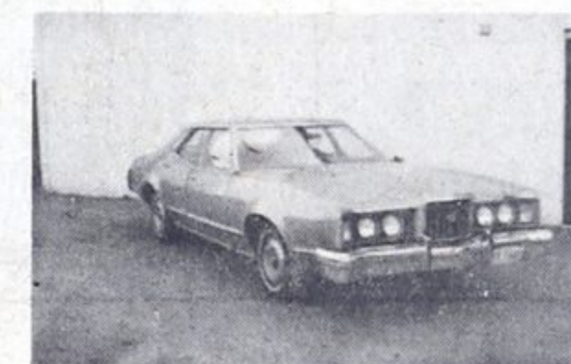
1973 Montego MX 4 door sedan, V8, power steering & brakes, blue Lic. FKJ 642 42,000 miles