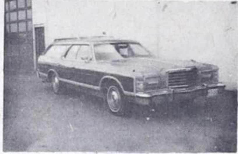
1976 Country Squire Wagon Cloth interior, air conditioning, fully equipped, gold. Lic. KFT 237 16,000 miles