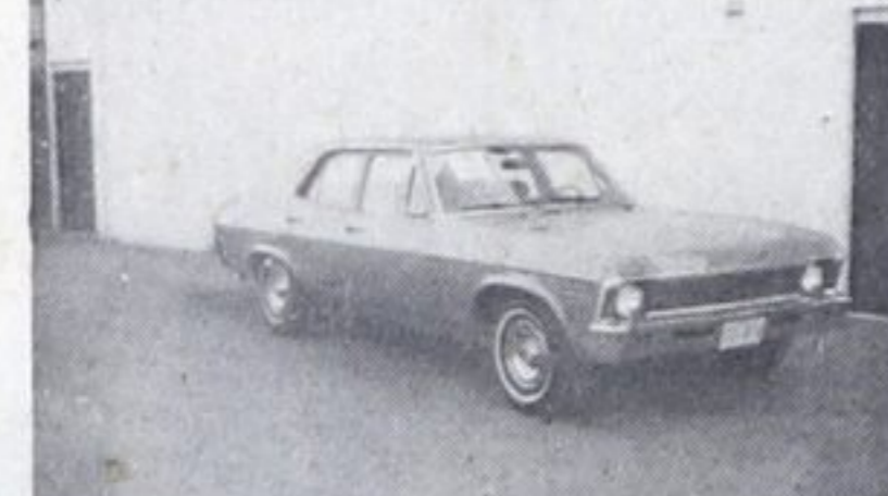
1972 Nova 4 door, 6 cyl., automatic, power steering, gold Lic. FEC 876 45,000 miles