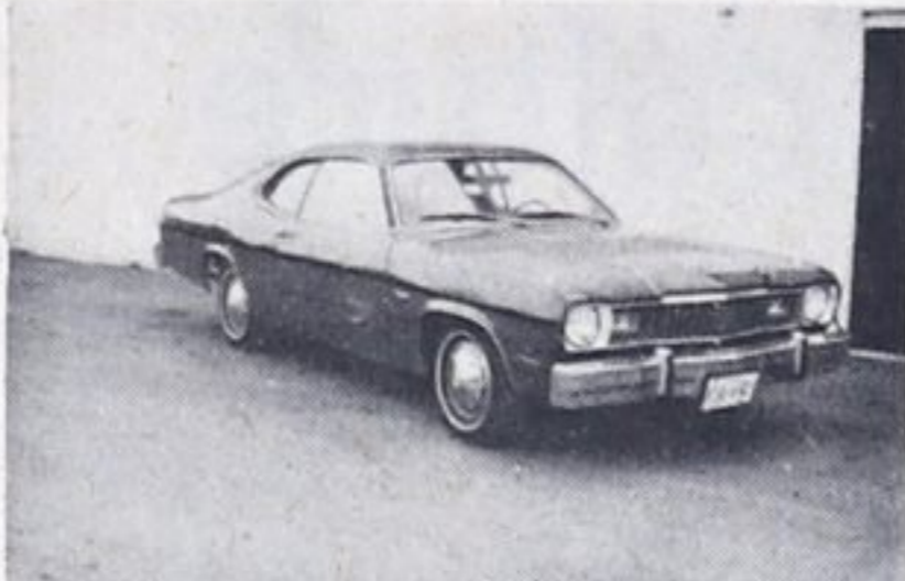
1976 Duster 2 door Deluxe, 6 cyl. automatic, power steering, radio, red & black Lic. KVA 692 12,000 miles