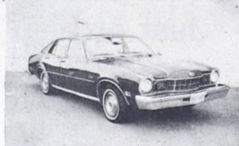
1975 Mercury Comet Deluxe model, 4 door, radio, 6 cyl automatic, P. St., dark brown Lic. HUC 607 28,000 miles