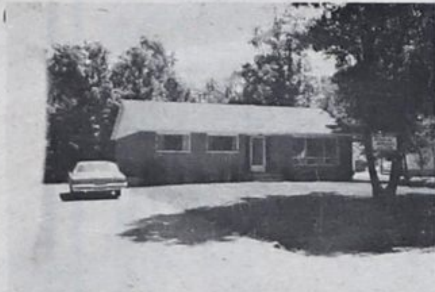
9. PRICE REDUCED 3 bdrms. brick bungalow with fine new rec. rm., hardwood floors. Top condition throughout. Everton Dr. 88x165 lot. Reduced to $49,900.