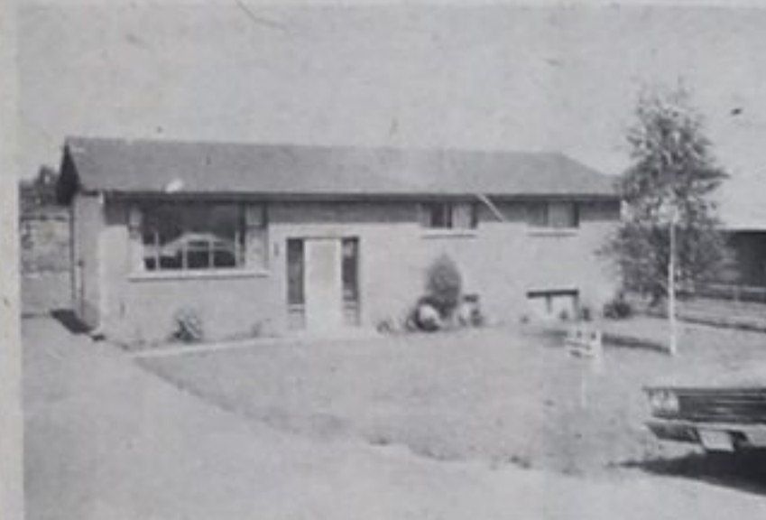
7. SUNNYSIDE BUNGALOW 3 bdrms. new rec. room, nicely carpeted. Very neat throughout. Price $39,900.