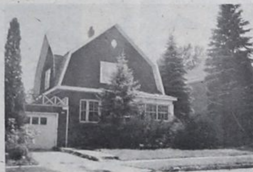
4. FIRST TIME BUYER? Here's bargain. Owner will take $5,000 down and carry mortgage on this beautiful older 2-storey brick home, 3 bdrms., 4 pc. bath. Near public school. New H.W. furnace. Attached garage. Top condition. $35,900.