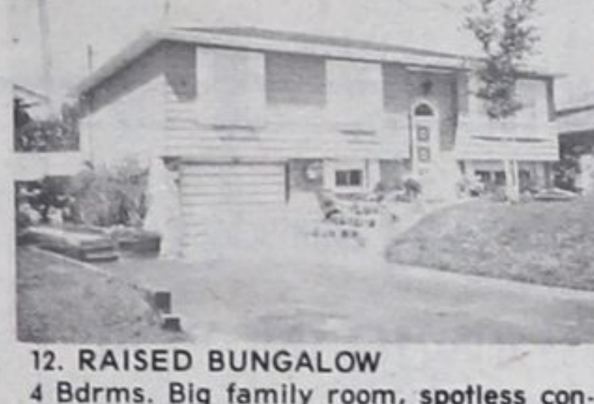
12. RAISED BUNGALOW 4 Bdrms. Big family room, spotless condition. Nicely landscaped, att. garage, dble. paved drive. Cedar St. —close to school. $51,900.