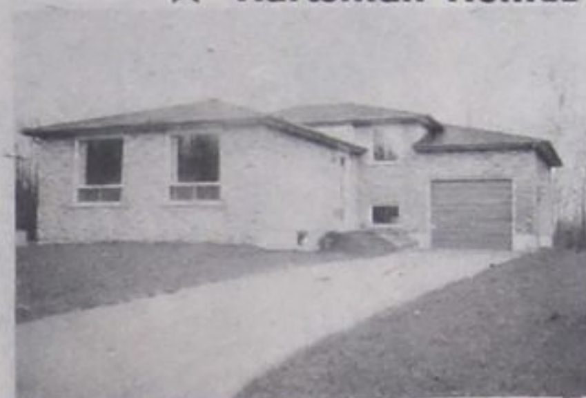
Priced from $42,900. $5,000. DOWN

Hugel Heights, Midland's most convenient new housing development, offers many advantages including: walking distance to Bayview School, Monsignor Castex Separate School, Midland Secondary School, Highway 27 Shopping Malls, new area Hospital; plus: underground wiring to homes, curbs, storm and sanitary sewers, mainly 60' and 70' lots.