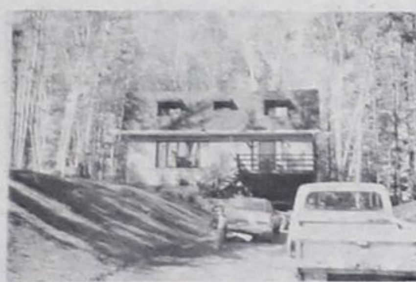
16. FIVE BDRM. CUSTOM Built home in Portage Pk. Beautiful family room has fireplace. Priced to sell at $67,000.