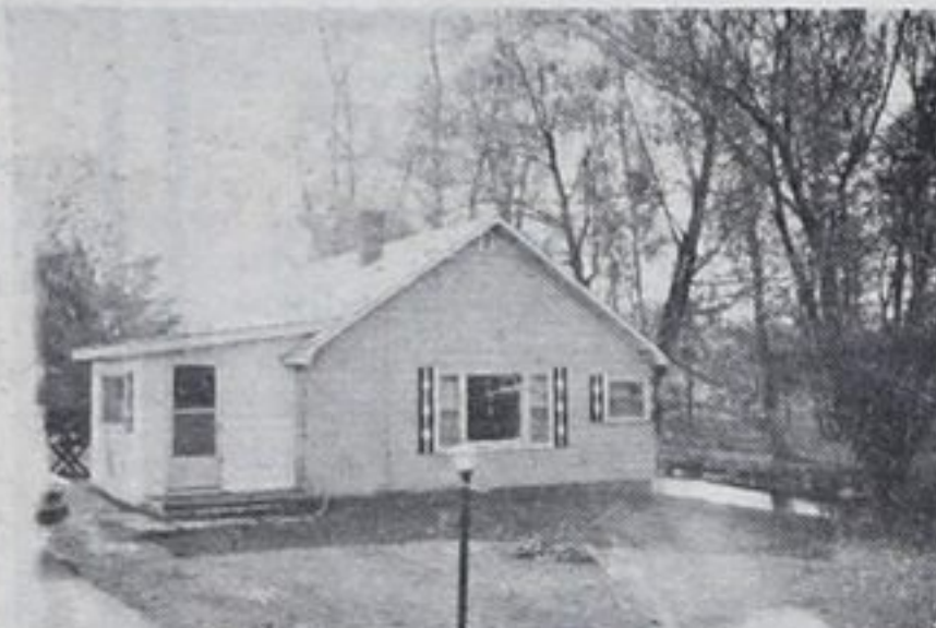
1. RAINBOW TROUT at your side yard, over 100' shoreline on Sturgeon River. Very clean 2 bdrm. home with den, kitchen, living room and 4 pc. bath. Ideal retirement home. $31,900, $10,000 down.