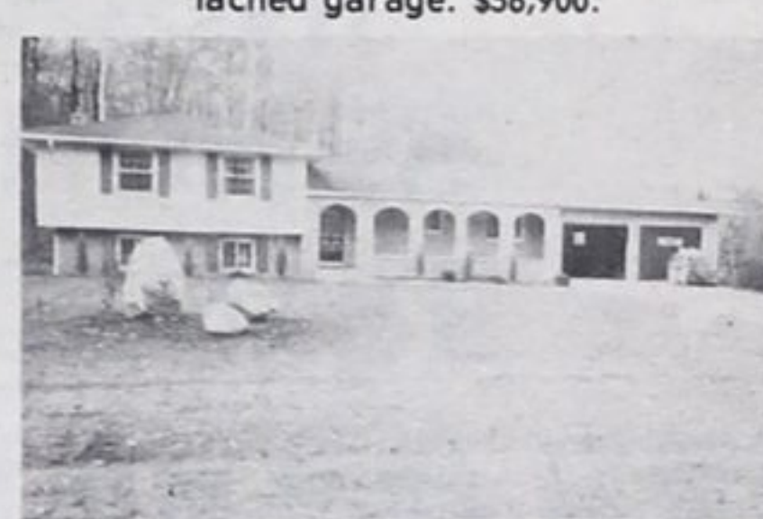
17. CUSTOM BUILT—PORTAGE PARK With extra features: family rm., fireplace, patio doors to screened porch, Intercom system, 2 baths, lge. dble. garage. All 1st quality materials. 2400 sq. ft. finished living space. $83,500.