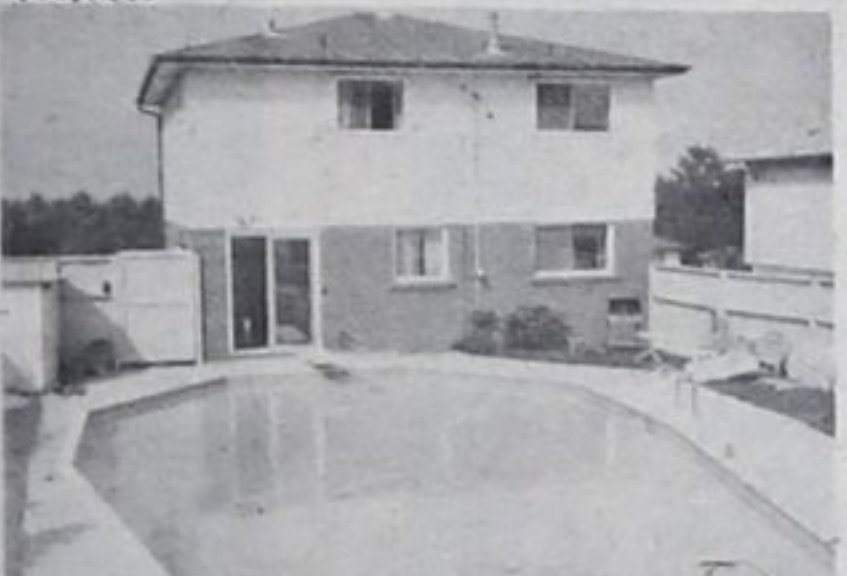
8. SWIMMING POOL Enjoy Spring, Summer and all more with inground pool. Modern 2 storey home has 4 bedrooms and beautiful view of Georgian Bay. Only $46,500. Owner leaving town.