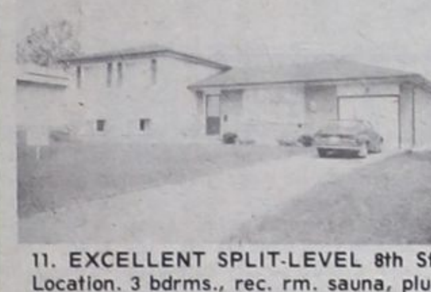
11. EXCELLENT SPLIT-LEVEL 8th St. Location. 3 bdrms., rec. rm. sauna, plus frig. and stove. Lot 75x100, beautifully landscaped. $49,900.