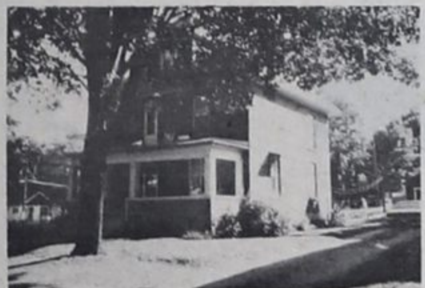
3. FINE OLDER HOME 4 bdrm. home could easily be converted to a duplex, kitchennette already of 2nd floor. $36,500.