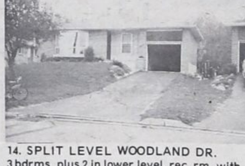
14. SPLIT LEVEL WOODLAND DR. 3 bdrms. plus 2 in lower level, rec. rm. with fireplace, 4 pc. and 2 pc. bath. Patio doors to enclosed patio and fenced yard. Attached garage. $56,900.