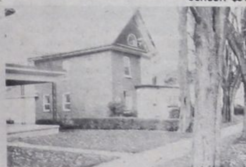
15. DOWNTOWN OLDER HOME Completely remodelled, superior decor, very spacious. Lr.-Dr.-Kitch., 3 bdrms., den, fam. rm. with walk-out to deck. Carpeted, $59,800.