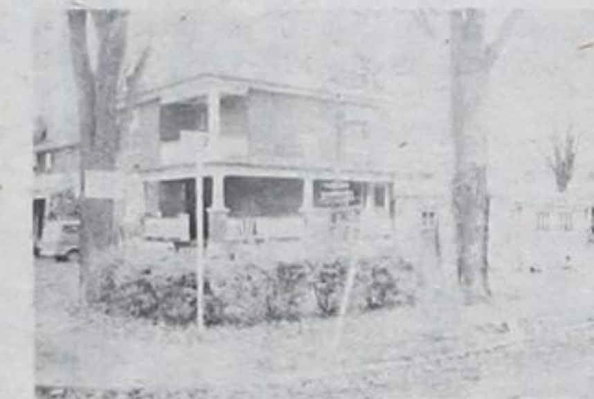
5. CENTRAL LOCATION 2 storey brick could be easily duplexed, 2 baths, 2 kitchens, 2 water heaters and electric services. Price $38,900.