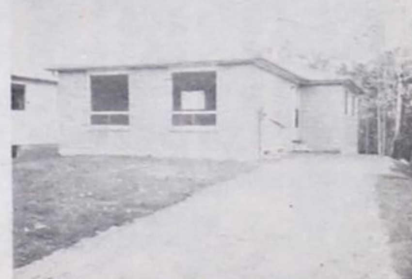
As low as $1,950. DOWN