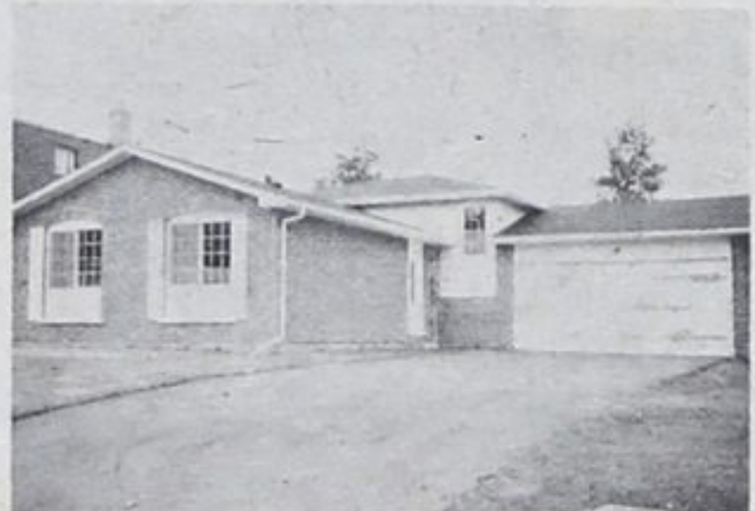
10. MAKE AN OFFER Owner must sell immediately. Try $5,000 down. Owner will carry mortgage. 4 bdrm. split level. West side near new hospital. Reduced to—$49,900.