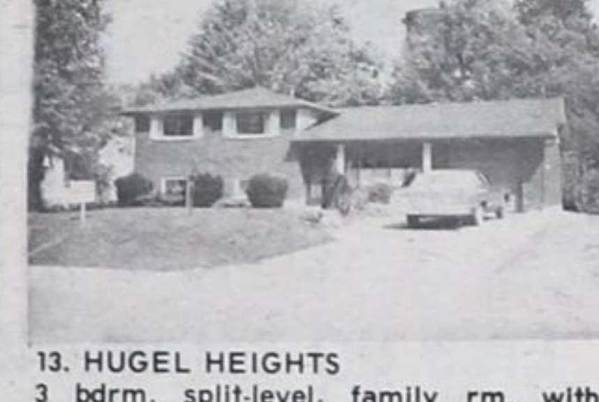
13. HUGEL HEIGHTS 3 bdrm. split-level, family rm. with fireplace. Landscaped 70 ft. lot with patio, paved drive. $53,500.