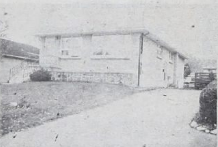
6. 4 BDRM. BUNGALOW Has extras including Acorn fireplace in rec. rm., dishwasher and air-conditioner. Landscaped 50x114 lot. East Side $39,500.