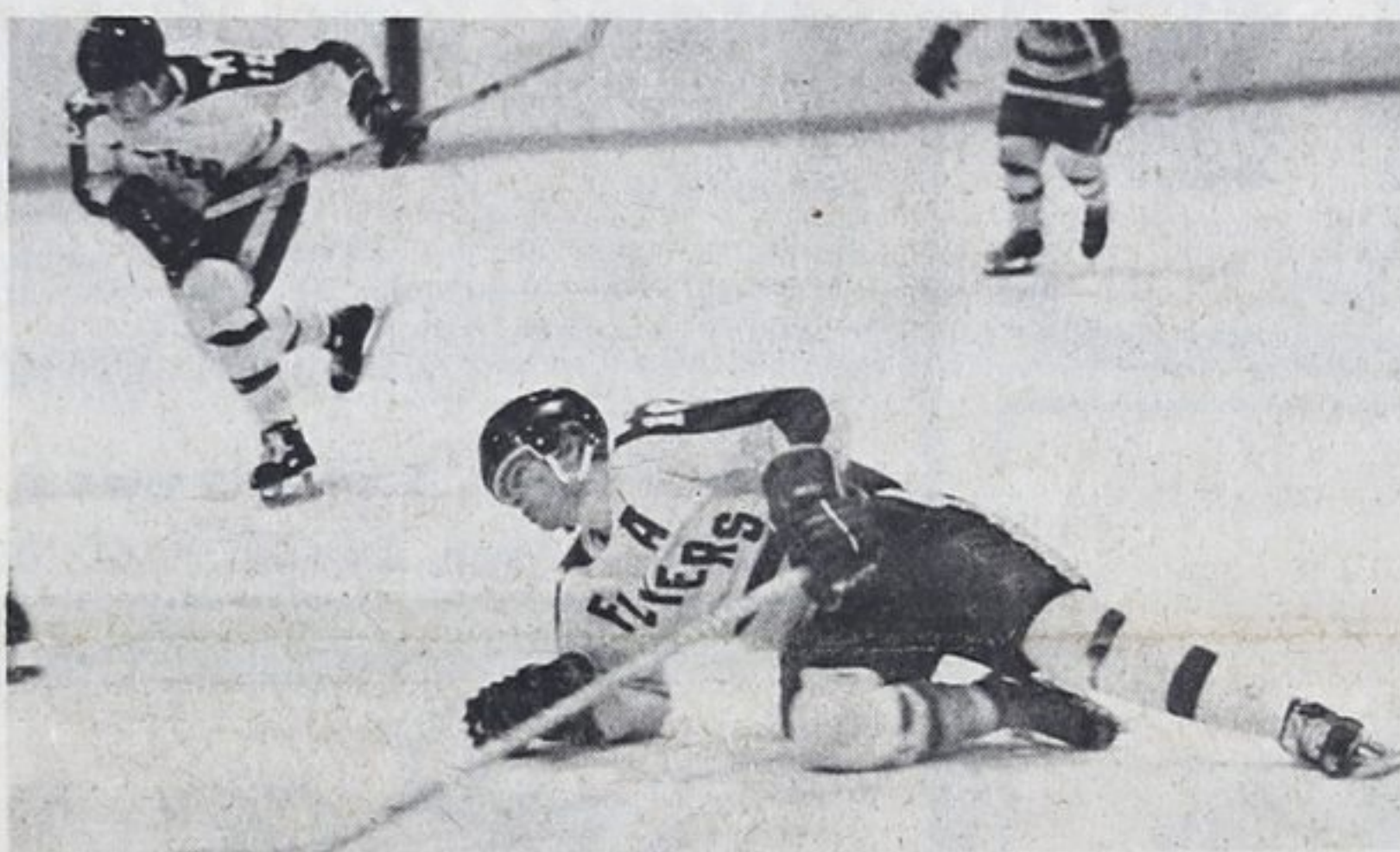
Falling down on the job