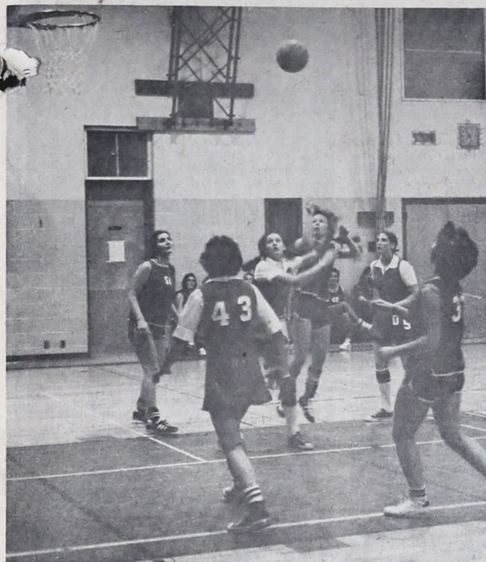
Going up for the shot

A Penetanguishene Secondary School player takes a shot during Saturday's senior girls invitational basketball tournament. PSS went all the way to the finals where they were defeated by Barrie Central 51-22.