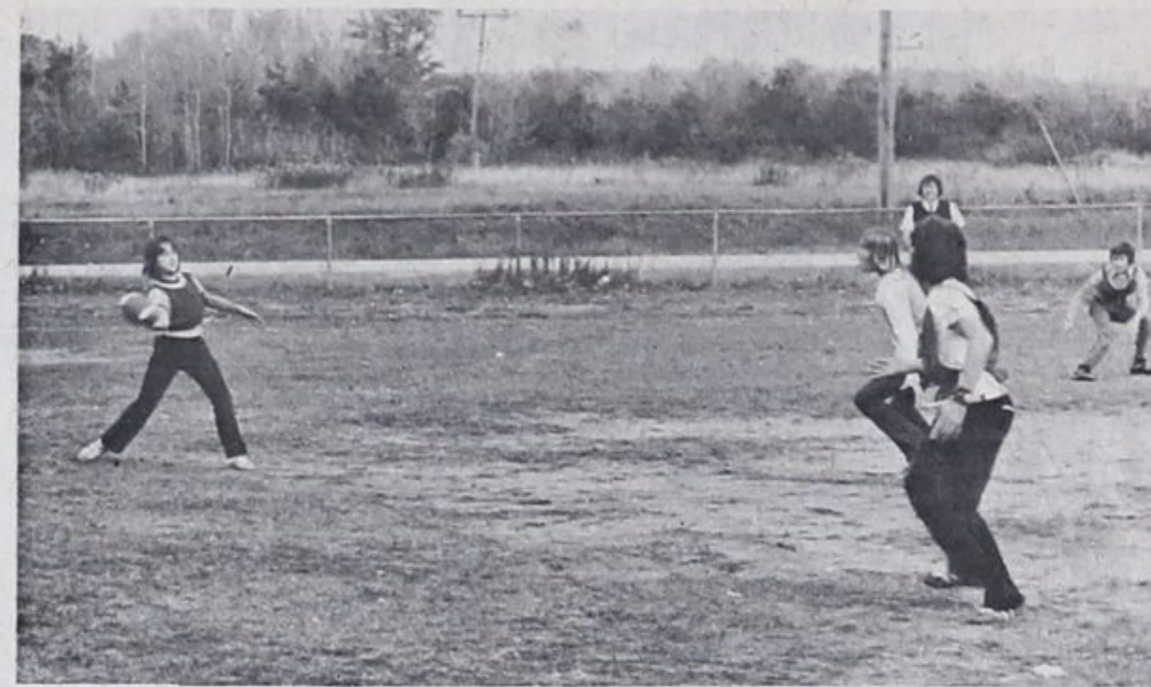
Dropping back for the pass