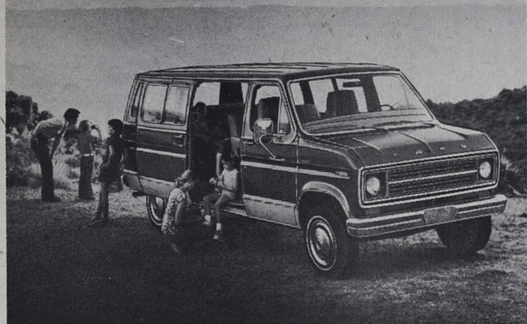
THE SCENIC WONDERS of a continent, once only available to the wealthy and the adventurous, can be enjoyed by virtually any family with a car. A sure investment in an exciting, trouble-free vacation this spring and summer is a car that is kept in optimum condition. Good maintenance will help keep the gasoline bill as low as possible as well as avoiding unexpected trouble that takes the fun out of trips.