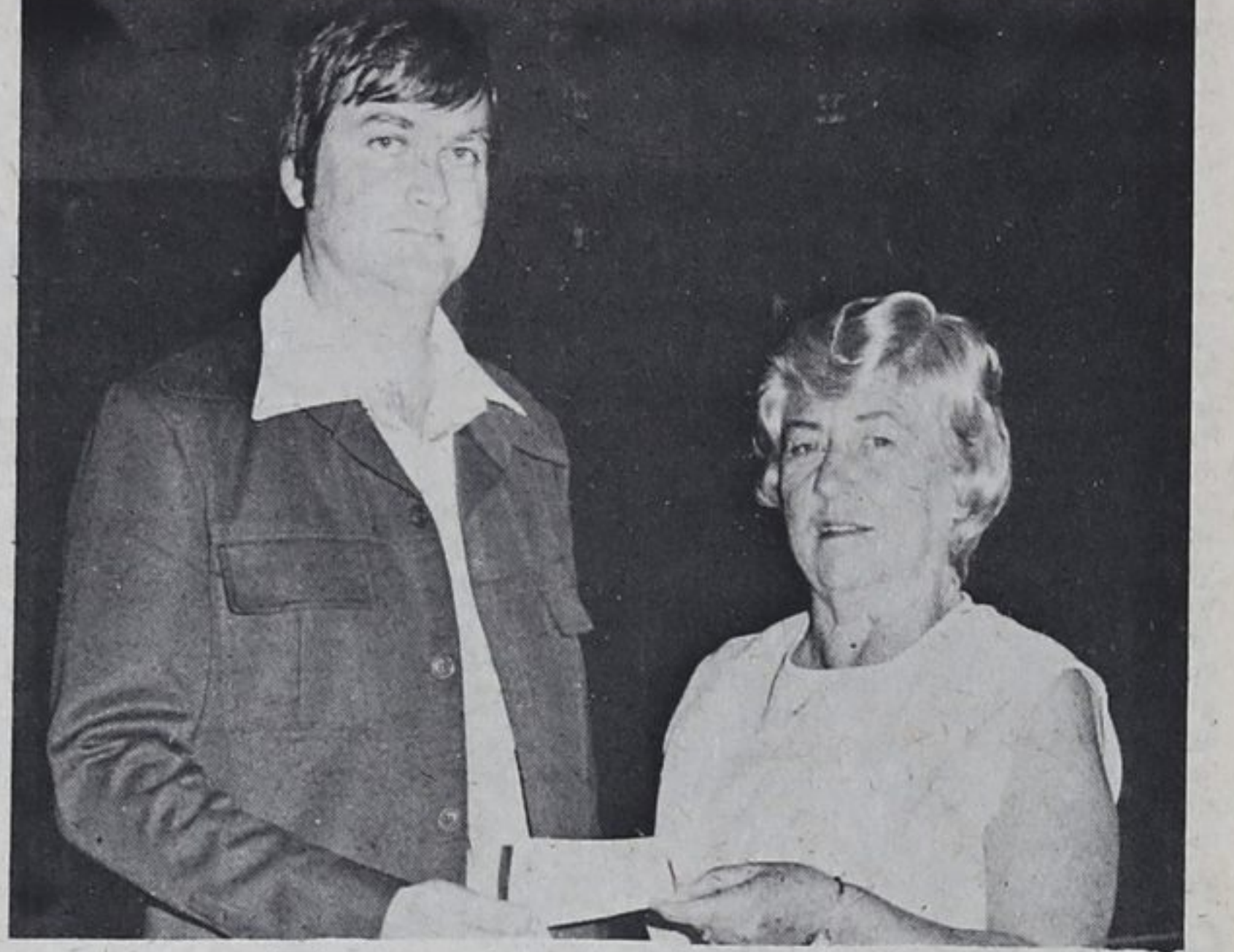
Towards new hospital

The Margaret Rebekah Lodge number 39 does its part help outfit the new Huronia District Hospital with a donation of $100. Presenting the cheque to