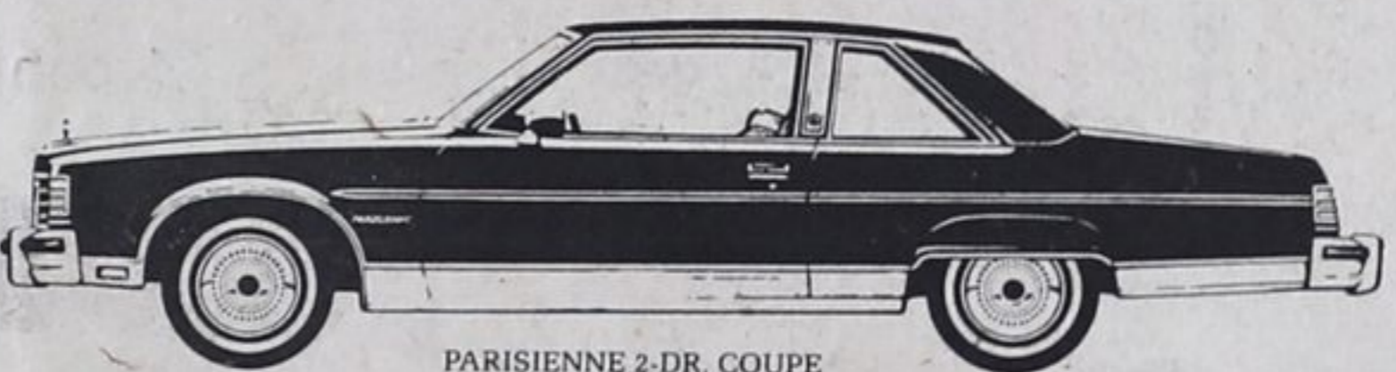
PARISIENNE 2-DR. COUPE