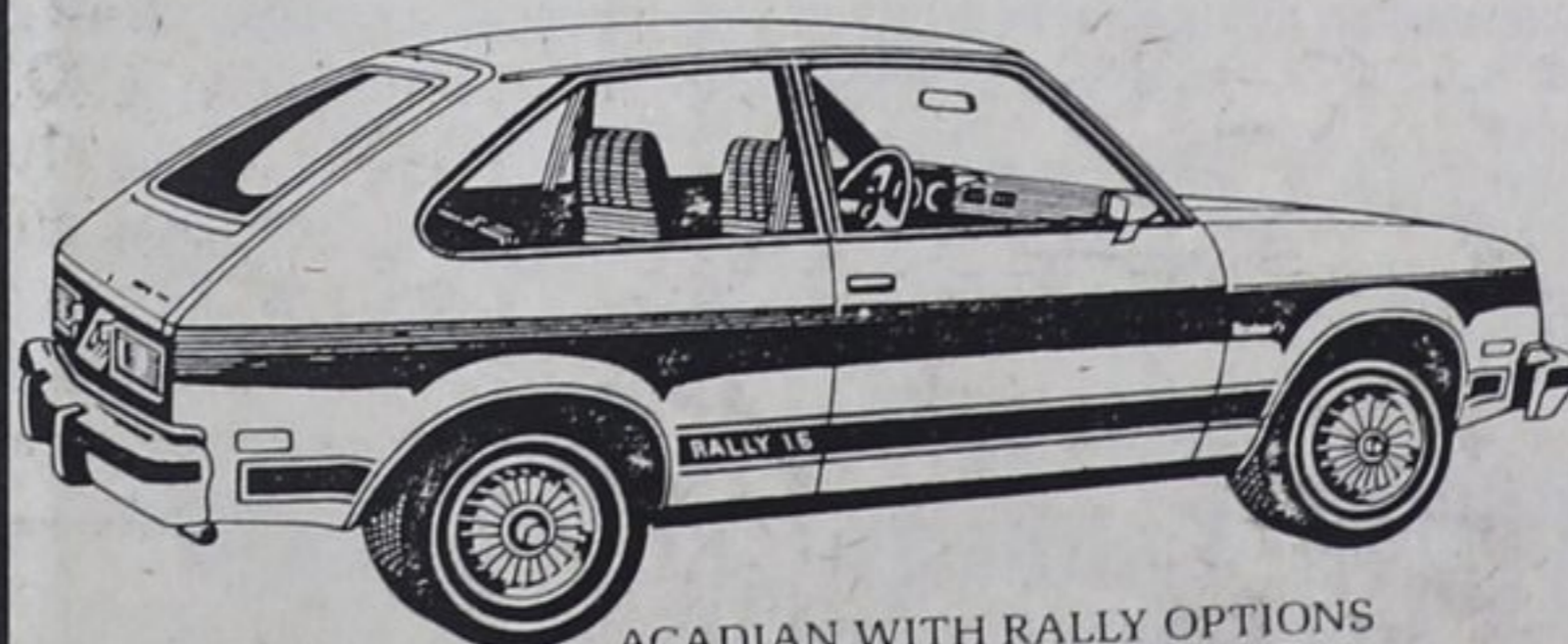
ACADIAN WITH RALLY OPTIONS