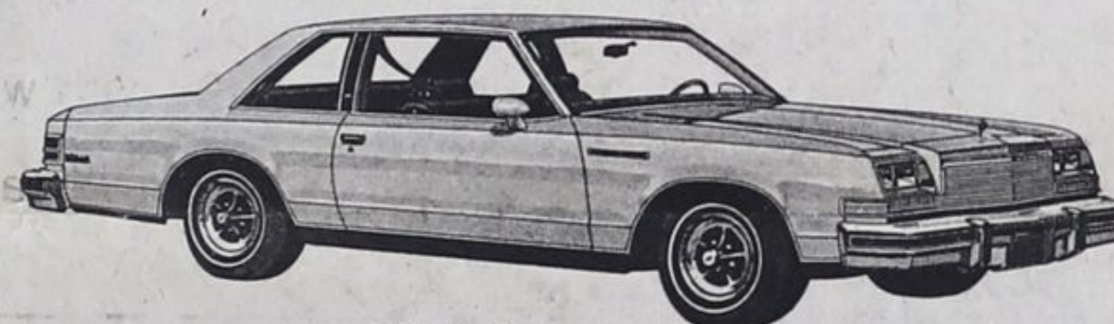
Le Sabre Sport Coupe