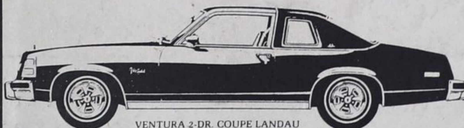
VENTURA 2-DR. COUPE LANDAU