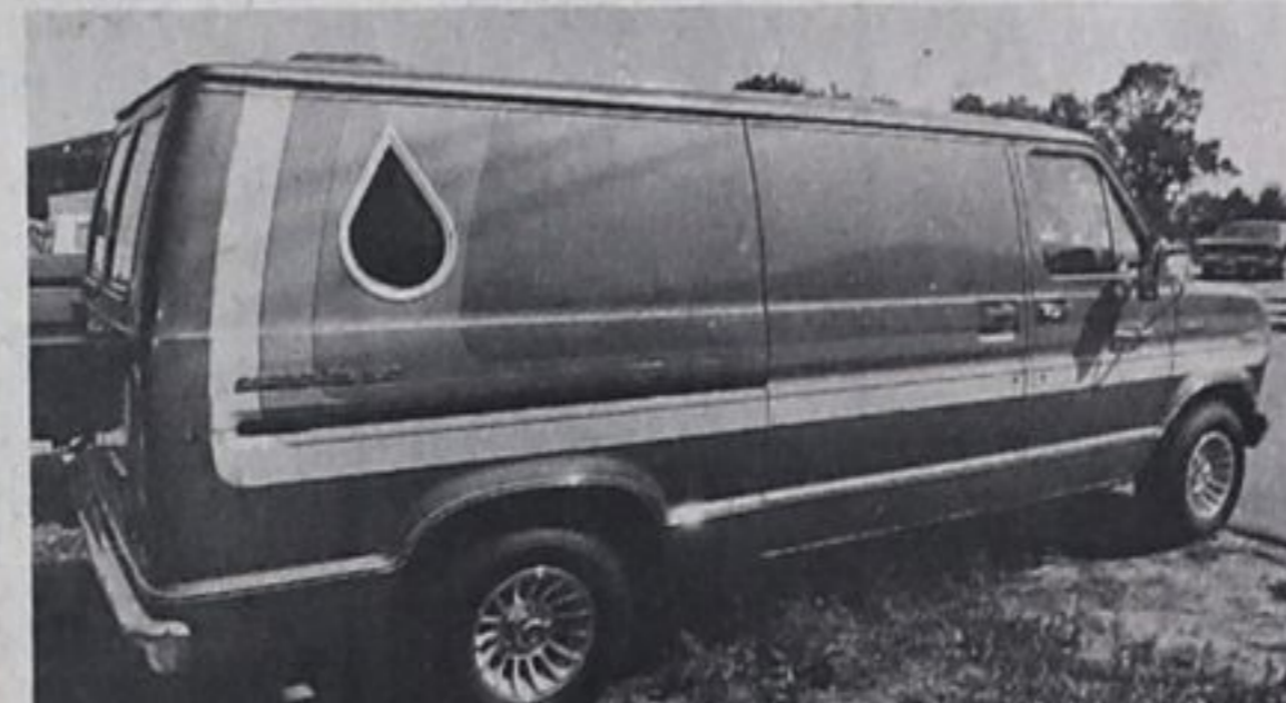
VAN CUSTOM EXTERIOR & MAGS - DO YOUR "OWN THING" WITH THE FULLY INSULATED INTERIOR!