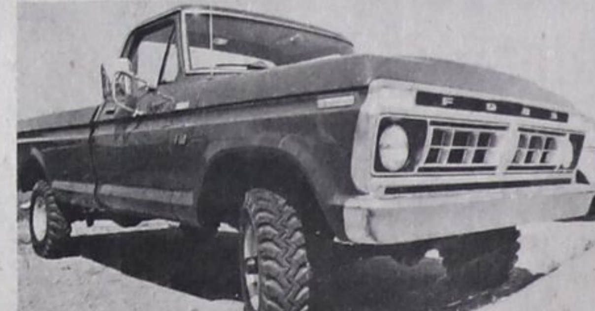
4 x 4