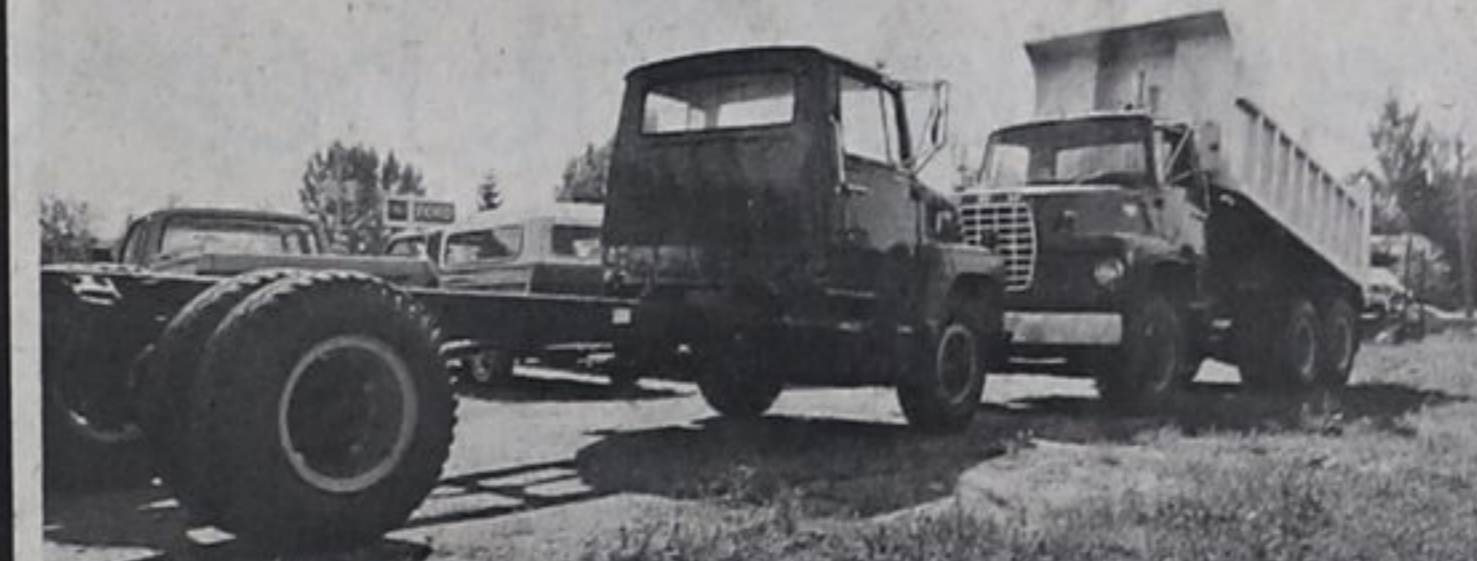
DUMP TRUCK & LN750 CHASSIS