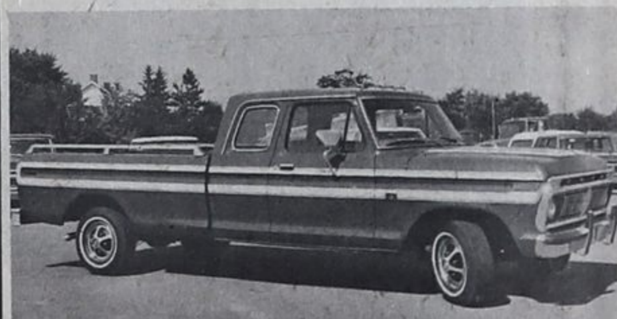
EXPLORERS - 8 TO CHOOSE FROM

— THAT IS PRICED RIGHT! — BURNS REGULAR GASOLINE! — HAS SPECIAL VALUE EXPLORER PACKAGE! — IS AVAILABLE FOR DELIVERY TODAY!