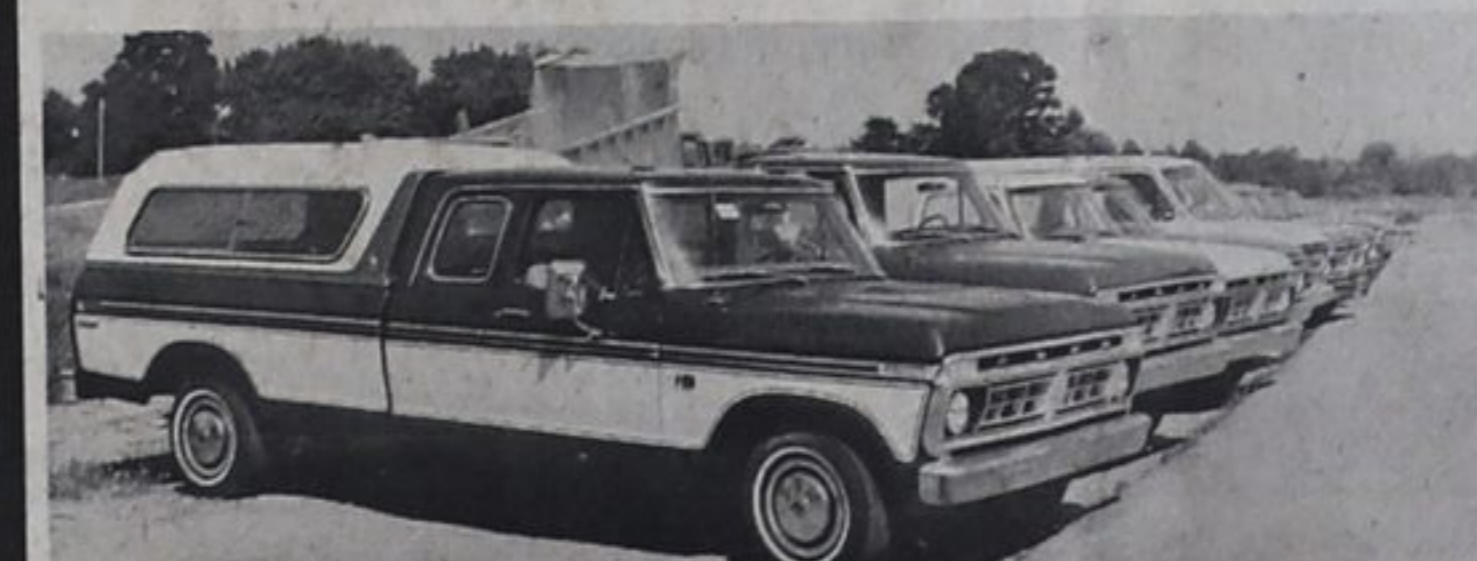
SUPER CABS - 9 TO CHOOSE FROM