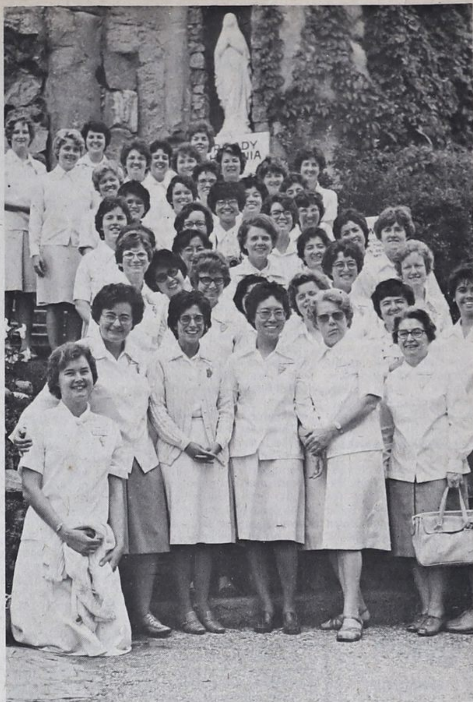
A long way from home

Horse Show - Coldwater Fairgrounds. Sponsored by Georgian Bay Riding Club.