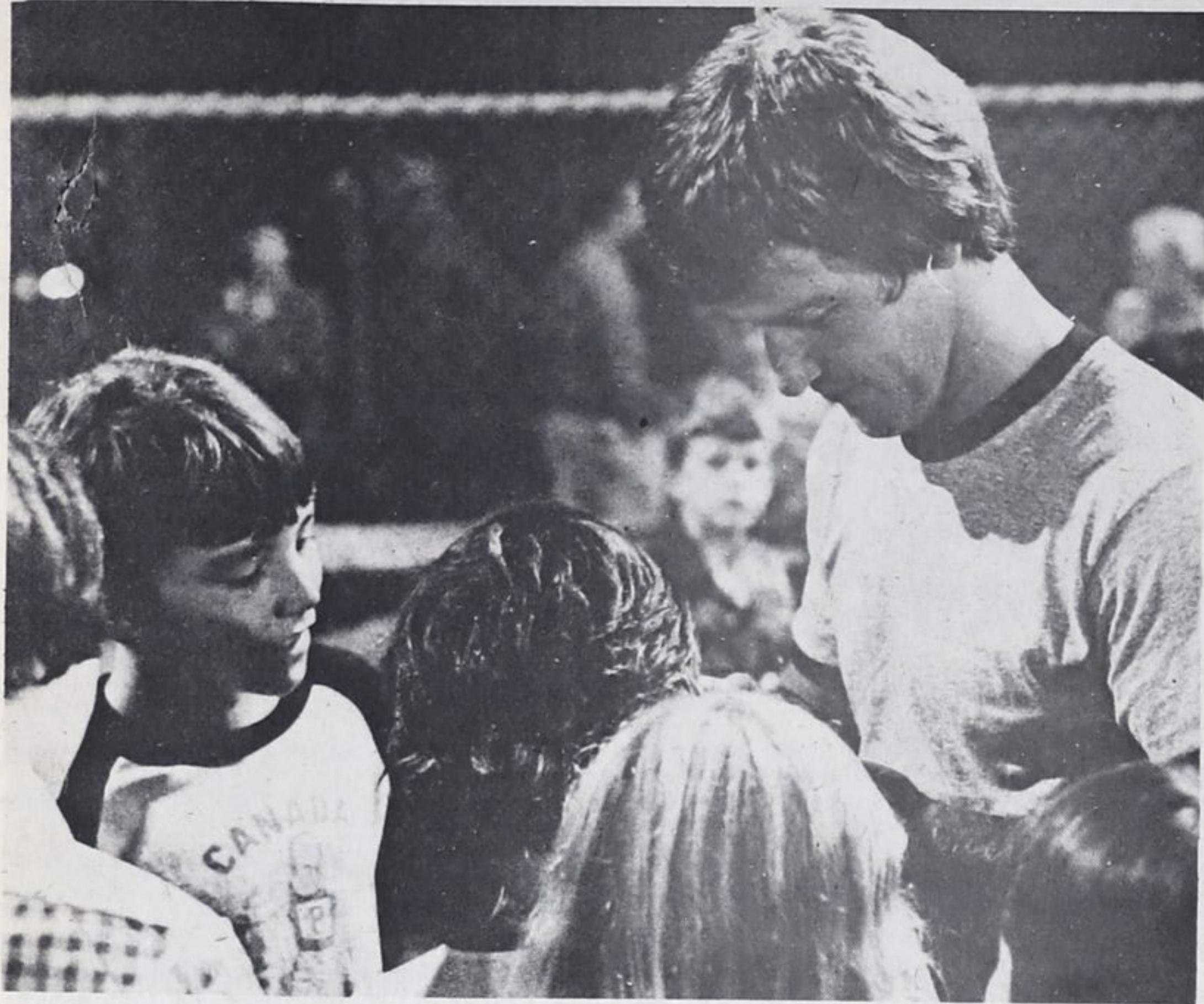
Surrounded by admiring fans