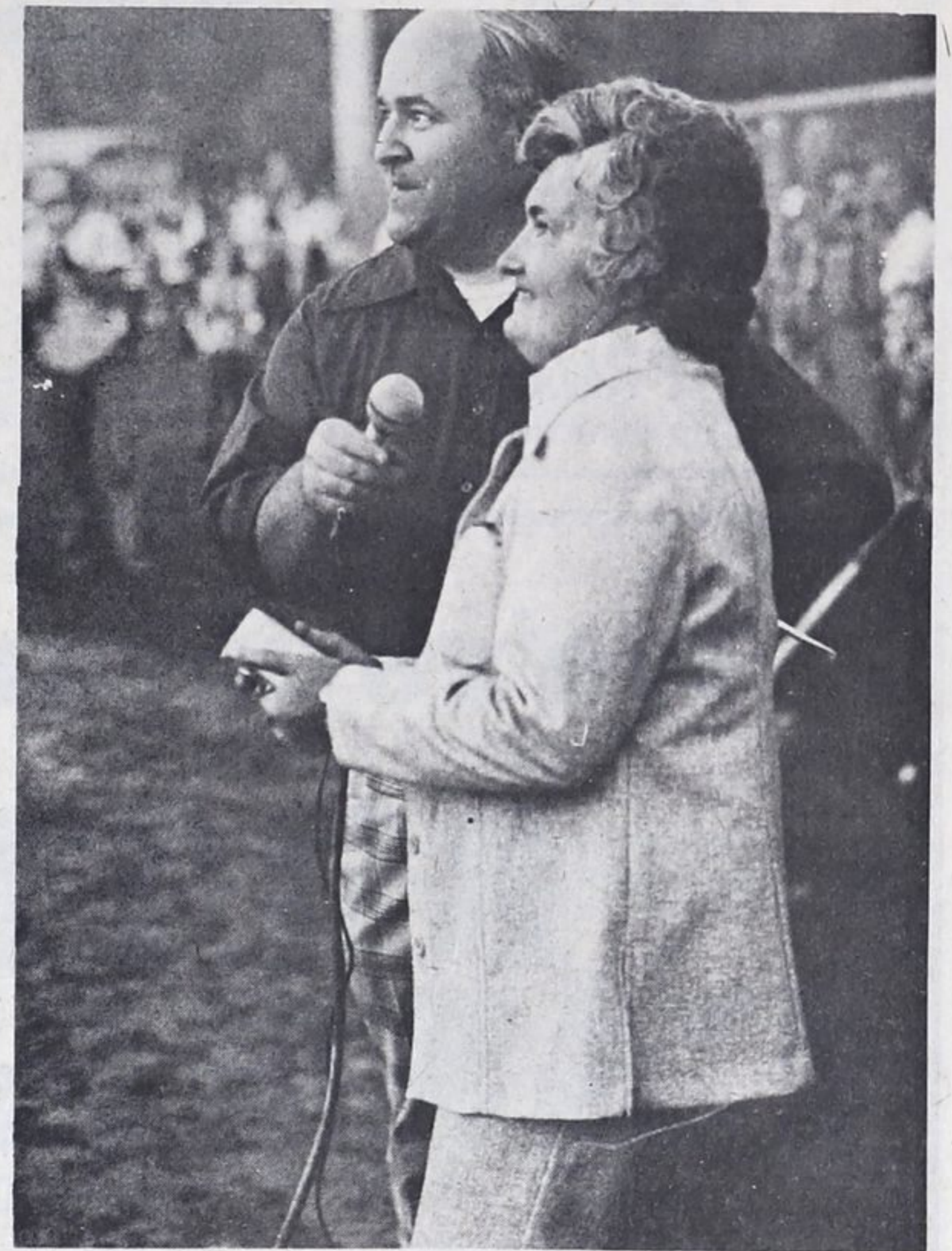
All systems "Go"