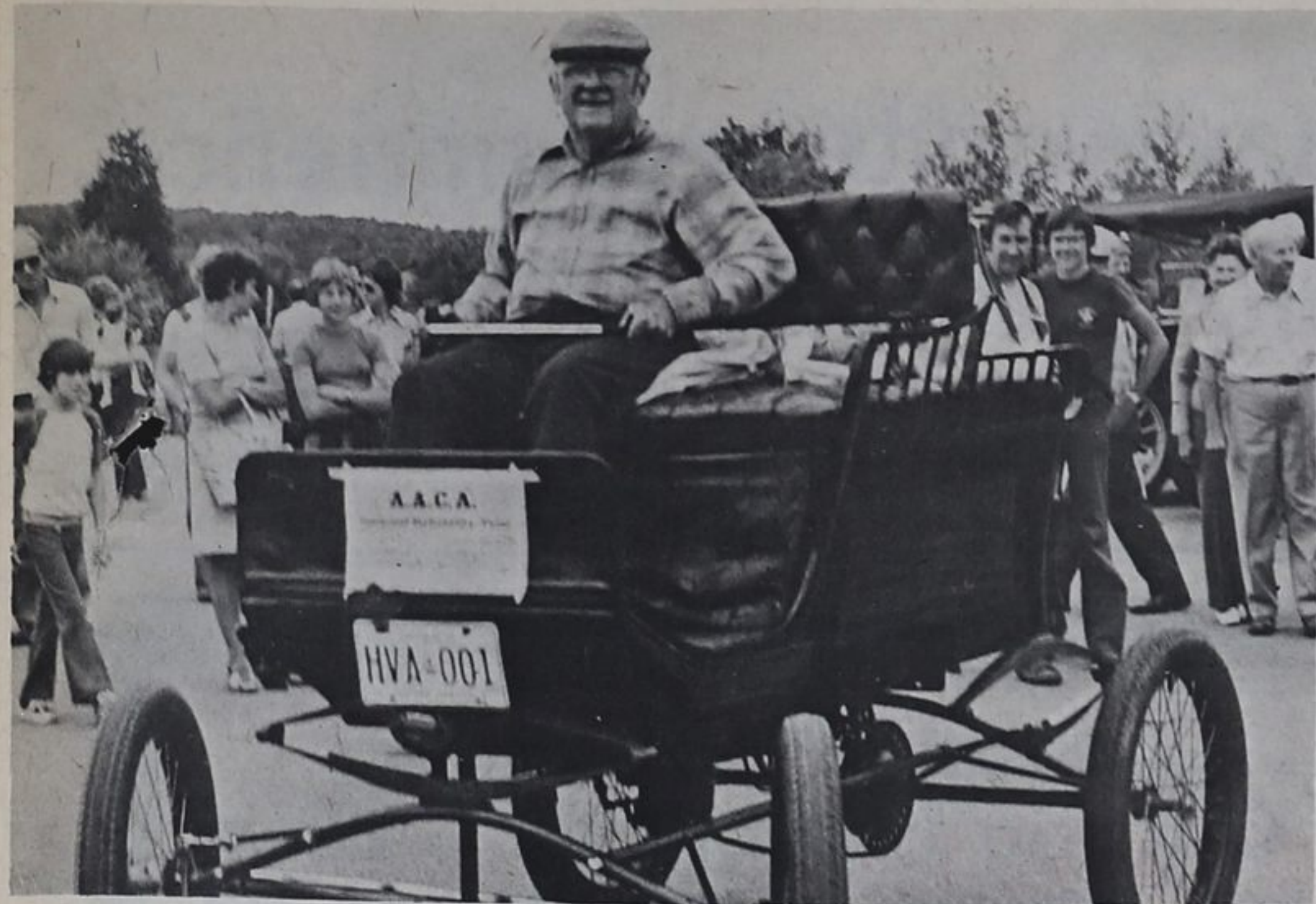
Look out - here I come