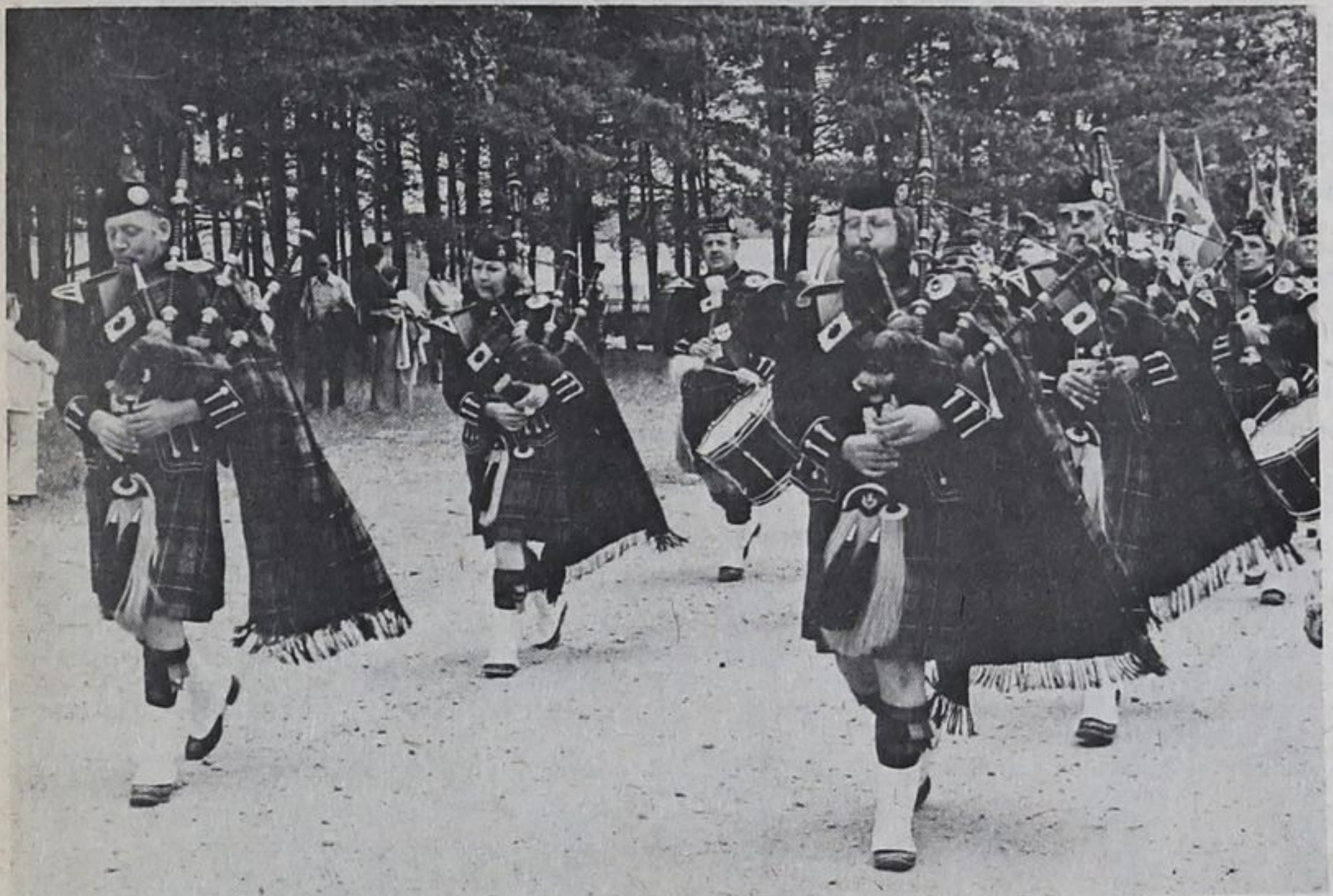
Photo by Battrick, Naval and Military Establishments, Penetanguishene.

A children's workshop being held at the Historic Naval and Military Establishments is so popular all four sessions through August are booked solidly. Children do such things as make soup with fresh vegetables from the garden, learn to work rope and tie knots, weave and spin yarn, and drill with their wooden muskets under the direction of the Establishments Guard.