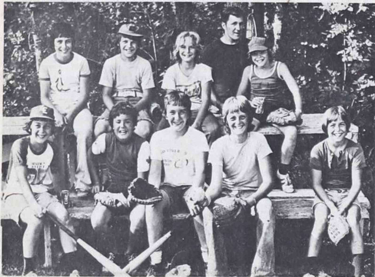
House League Softball Champs

Ontario Hockey Association officials were unavailable for comment on Monday.