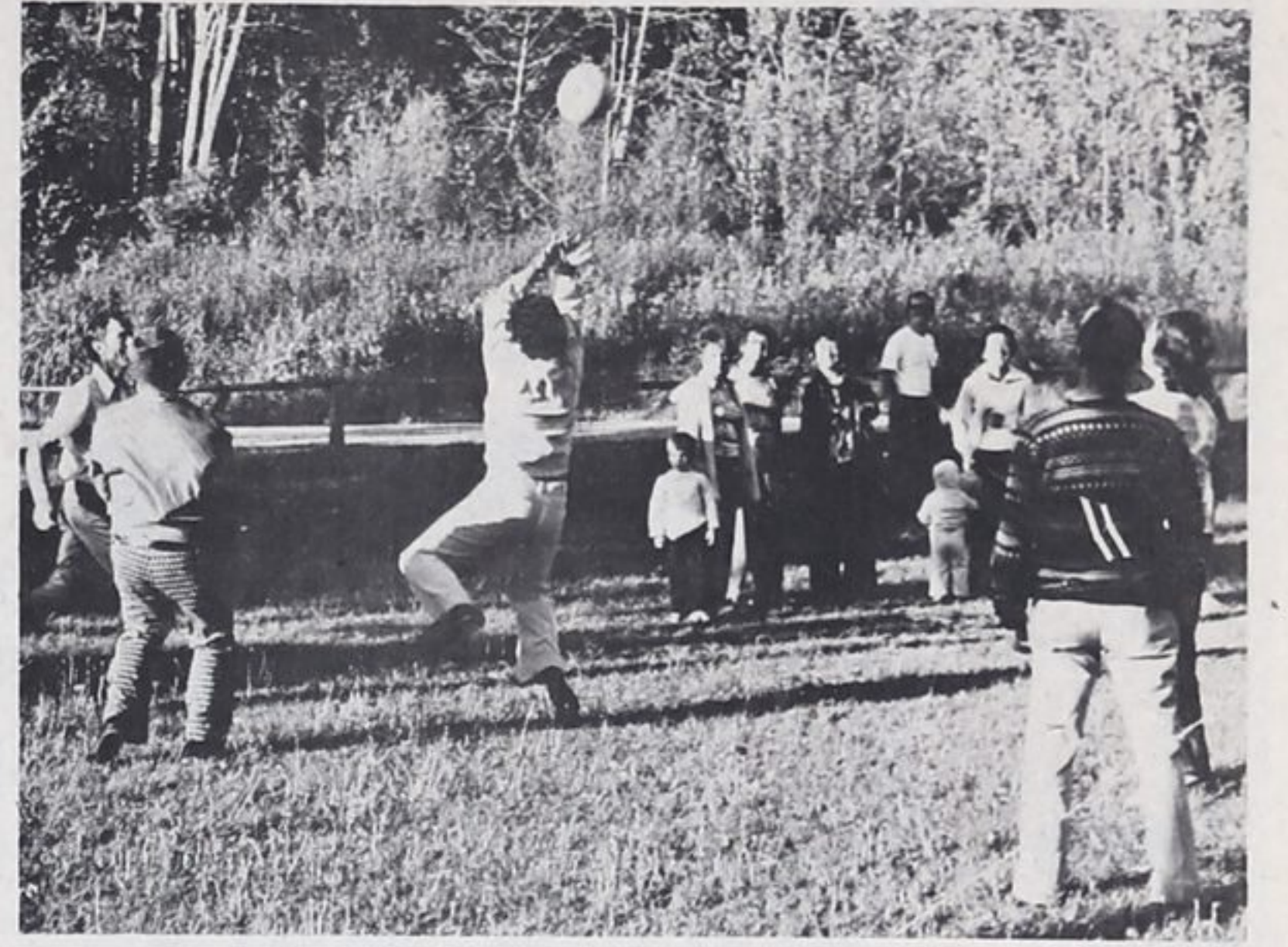
It's not quite the Olympics

The victory for Penetanguishene means the girls are in first place for the time being, but if both teams maintain their high calibre of play they could end up tied for first place at the end of the season with their only losses to each other.