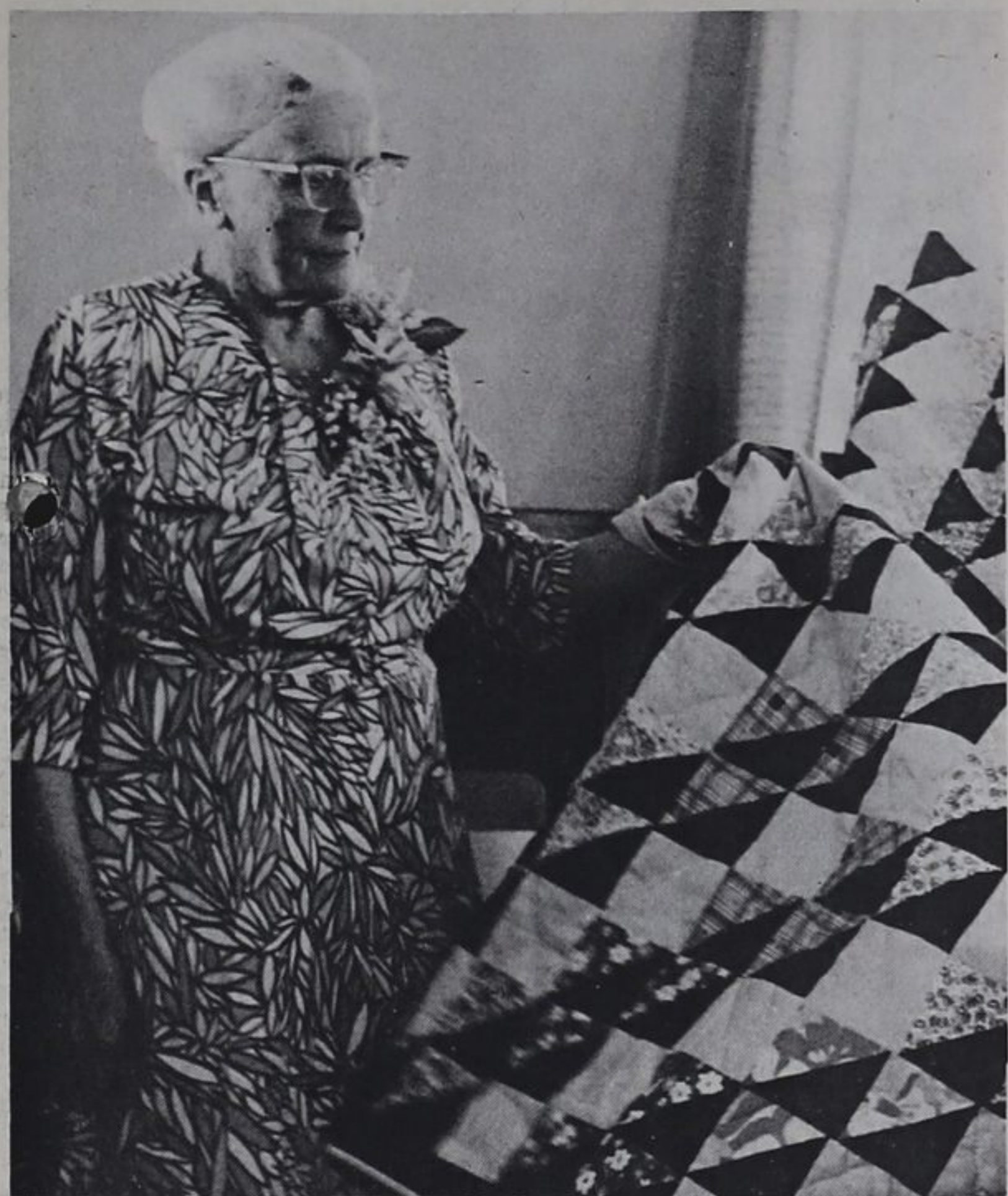
Quilts raise money

members, their guests and possible prospective members to socialize.