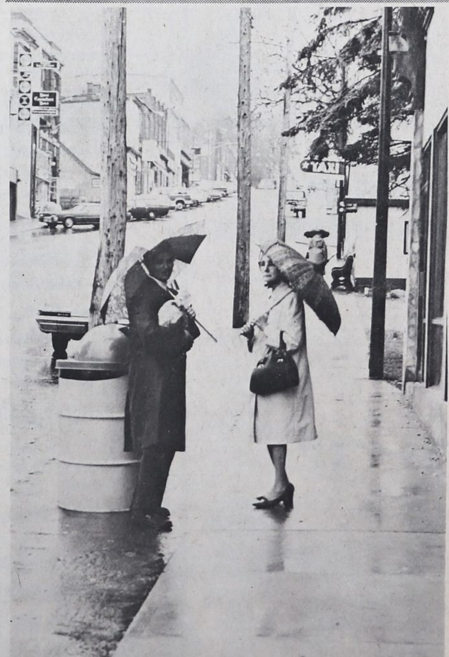
Out walking in the rain

The mill rate for a commercial separate school supporter will rise from 108.16 to 139.22 mills in 1976.