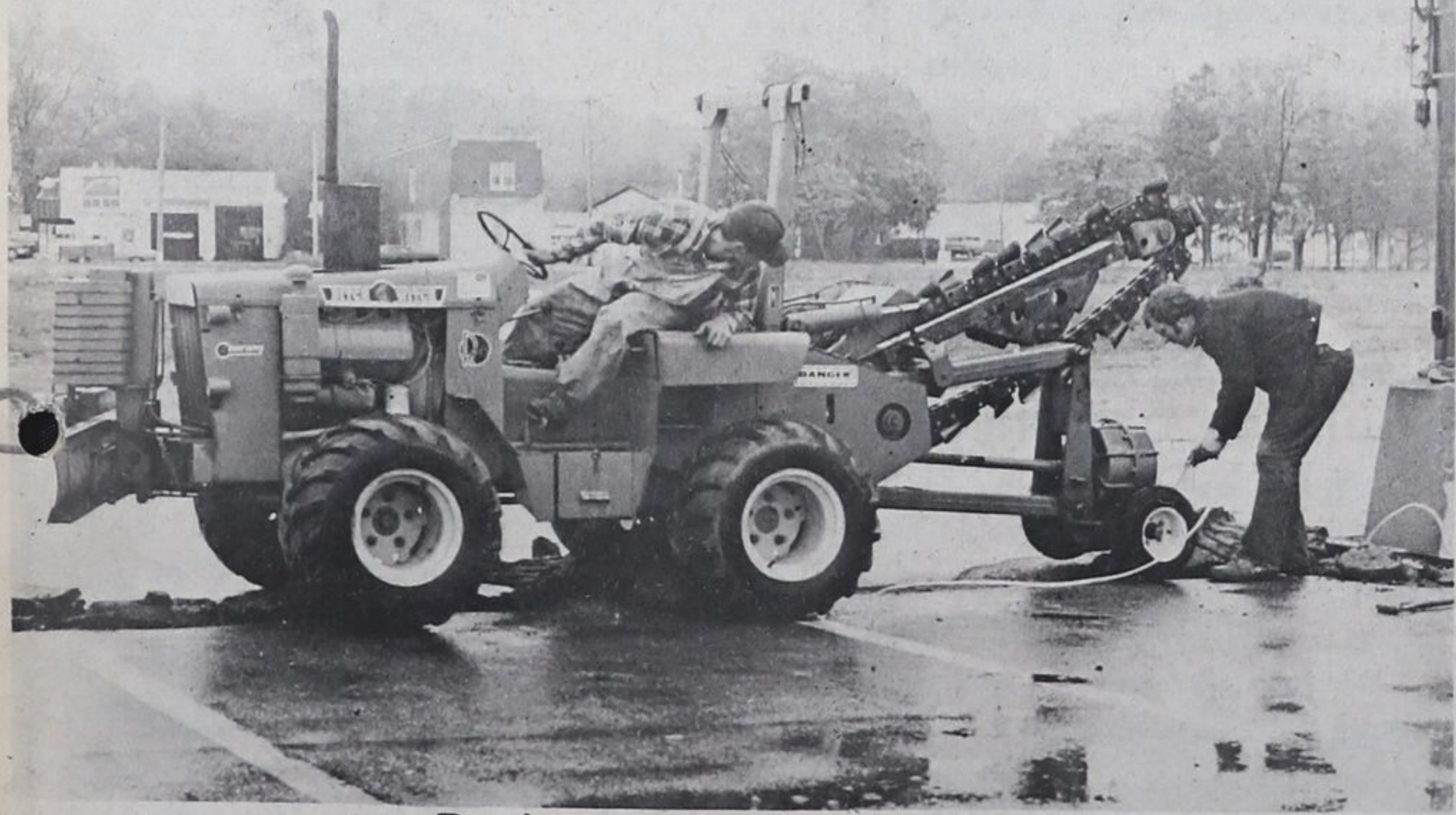
Replace underground wire

The Ladouceur vehicle sustained an estimated $15 damage, while the parked car, owned by Anthony Quigley, of 54 Water Street suffered an estimated $50 damage. No injuries were reported.