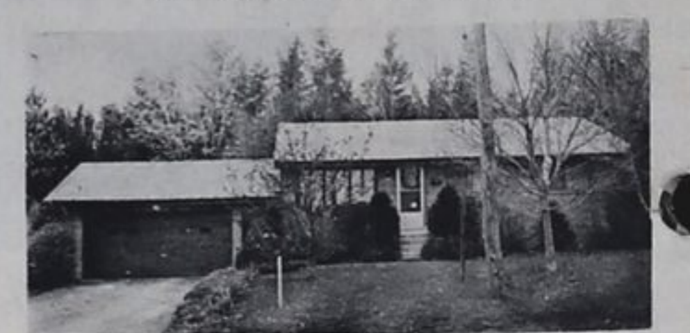
Large 130 x 111 ft. lot, 3 bedrooms, 4 pc. bath, finished basement, close to schools.

Rudolf Herrmann 526-6461 Doug White 534-7615 Yvette Marchand 526-4708