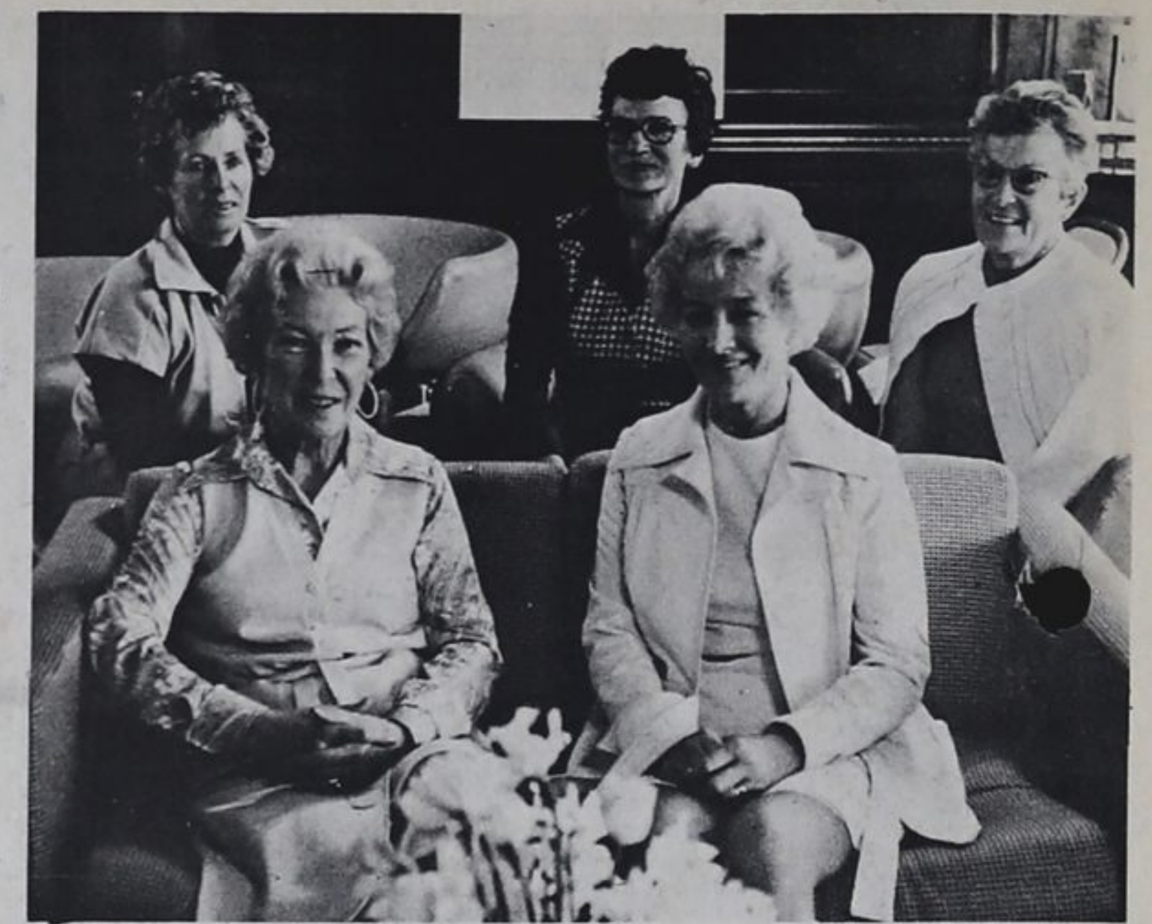
Ladies golf section