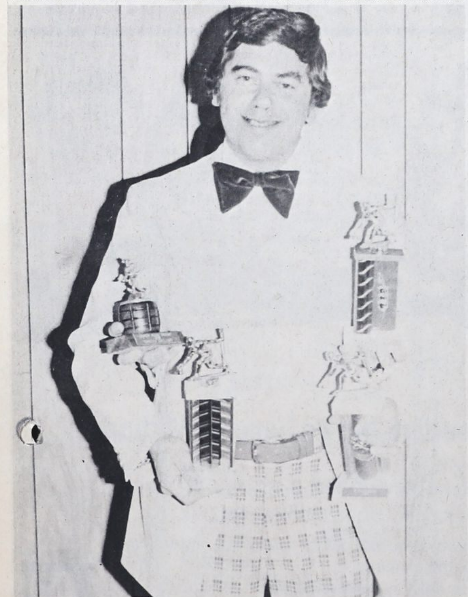
Look, ma — four hands!

The sheds on the property will likely be used by the public works department, at least until the subdivision is developed.