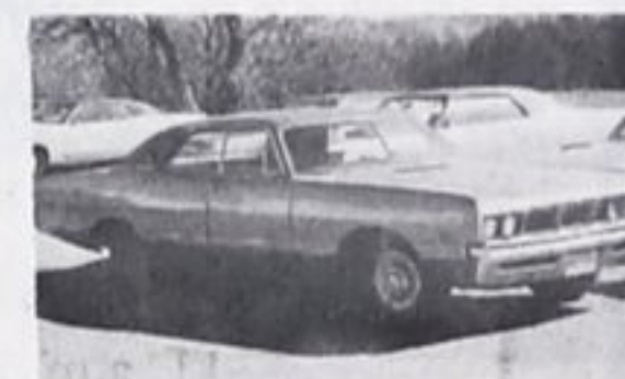
1971 Meteor Rideau 500 2 dr hardtop, vinyl roof, V-8 auto, ps, pb, radio, extra sharp and clean. Lic. AZV 222 $1,795.00