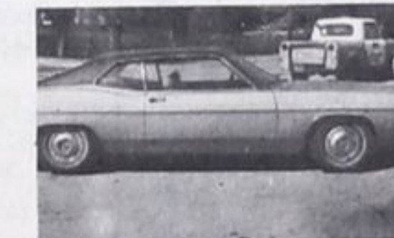
1970 Ford Gal 500, 2 dr hardtop fastback, vinyl roof, 8 auto, ps, pb, radio, vinyl trim. Low mileage. Lic. AHD 182 $1,495.00