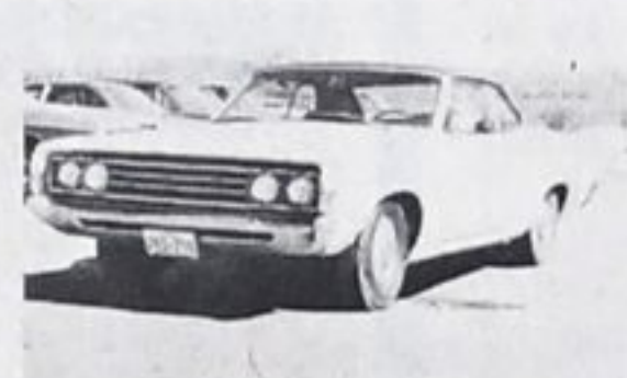
1969 Ford Fairlane 500, 2 dr hardtop, vinyl roof, V-8, auto, radio, certified. Lic. DUS 258 $1,150.00