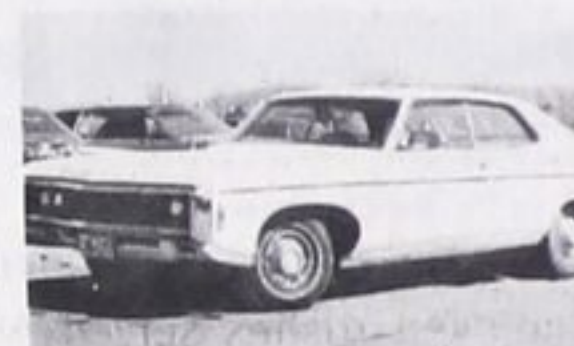
1969 Chev Impala four dr hardtop, V-8 auto, ps, pb, radio, new paint, certified. Lic. DUB 285 $1,195.00