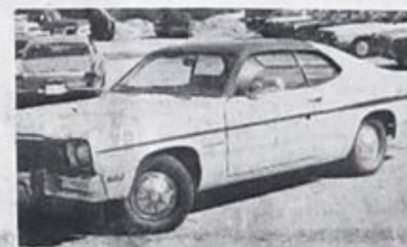
1973 Gold duster 2 dr hardtop, 6 auto, 1/2 vinyl roof, sharp. Lic. BOZ 683 $2,495.00

1971 Volkswagen Stationwagon, 1500 Series, automatic trans. Certified. Lic. BDT 425 $1,395.00 1973 Pontiac Ventura, 2 dr hatchback, 6 auto, radio, low mileage, certified. Lic. BHA $2,595.00 1972 Chevelle four dr, 6 cyl, auto, trans. clean, low mileage. Lic. BBS 598 $2,295.00 1973 Chev Belaire Stationwagon, four dr, V-8, auto, p.s., p.b., radio, certified. Lic. JMM 136 $2,695.00 1971 Buick Skylark, 2 dr hardtop, 6 cyl, auto, vinyl roof, vinyl trim, ps, radio, new paint, low mileage. An economy car with comfort and class. Certified. Lic. HHL 459 $1,995.00