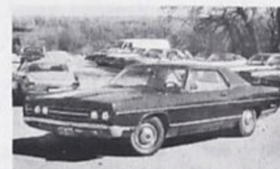
1969 Ford 2 dr hardtop, V-8, auto, ps, pb, radio, maroon with white vinyl trim. Certified. Lic. DUK 863 $995.00