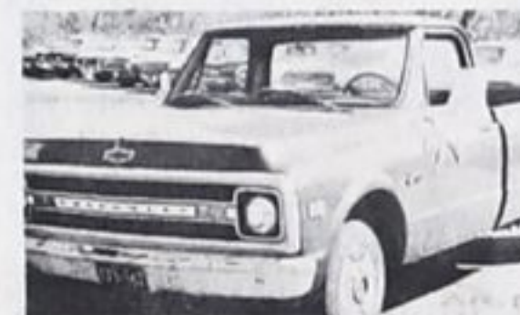
1970 Chev 1/2 ton pickup, 6 cyl std. trans, low mileage, long-wide box. Certified. Lic. T73167 $1,995.00