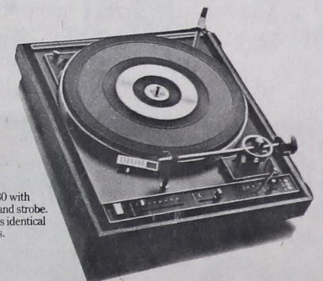
This is the 980 with solid state speed control and strobe. The 960 is identical except for these two features.

STORE HOURS Monday to Saturday — 11:00 a.m. to 7:00 p.m. FRIDAY — 11:00 a.m. to 9:00 p.m.