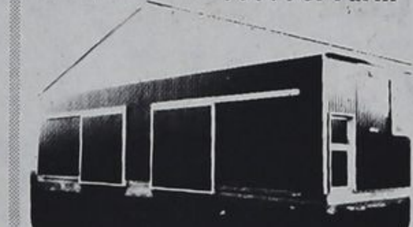
POLE TYPE BEEF BARN

PROPLAN will help you from the start to plan, design and erect your building.