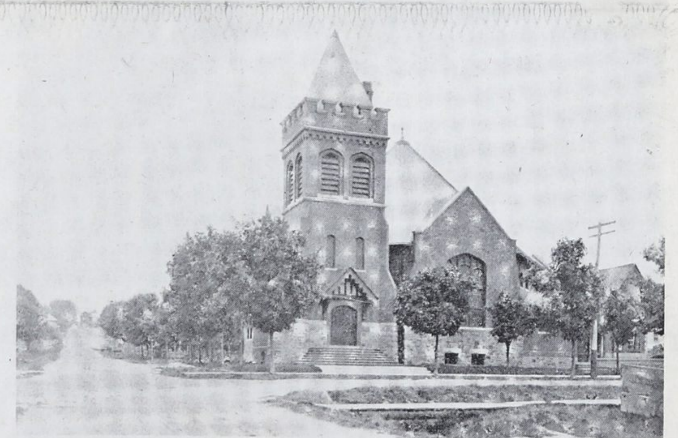
The Presbyterian Church then