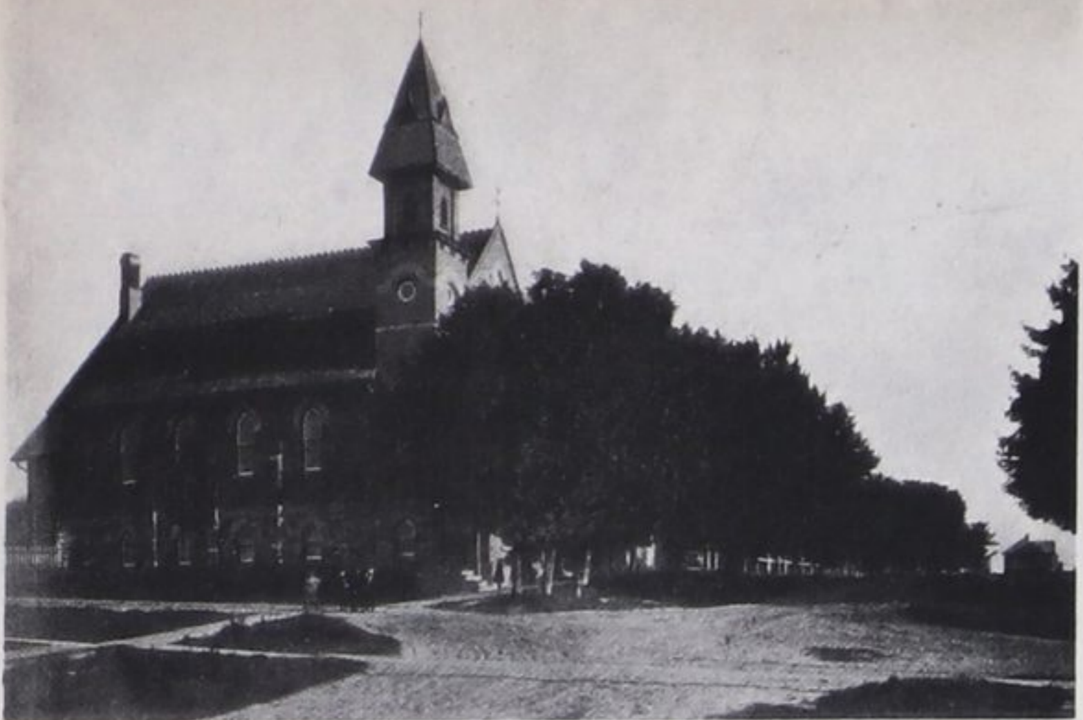
The Baptist Church