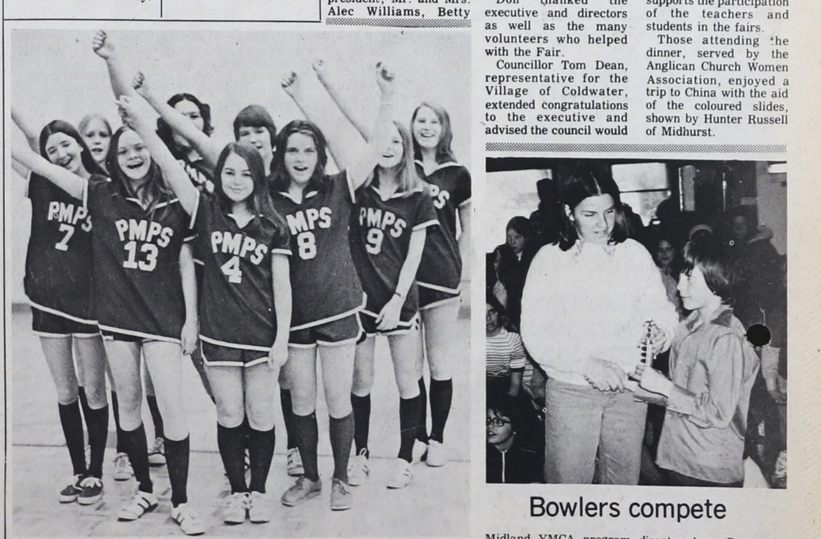
Basketball runners-up Port McNicoll School girls' basketball team was runnerup in the Midland Secondary School area basketball tournament last weekend.