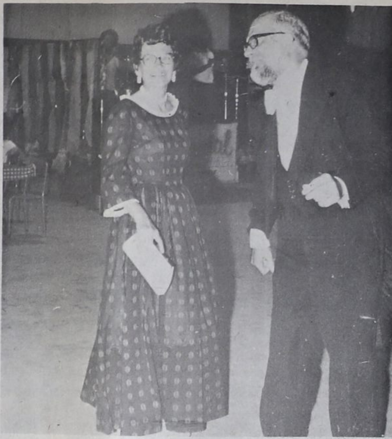
Dancing up a storm

245 King St., Midland - 526-2171 and Balm Beach Rd. - 526-7762