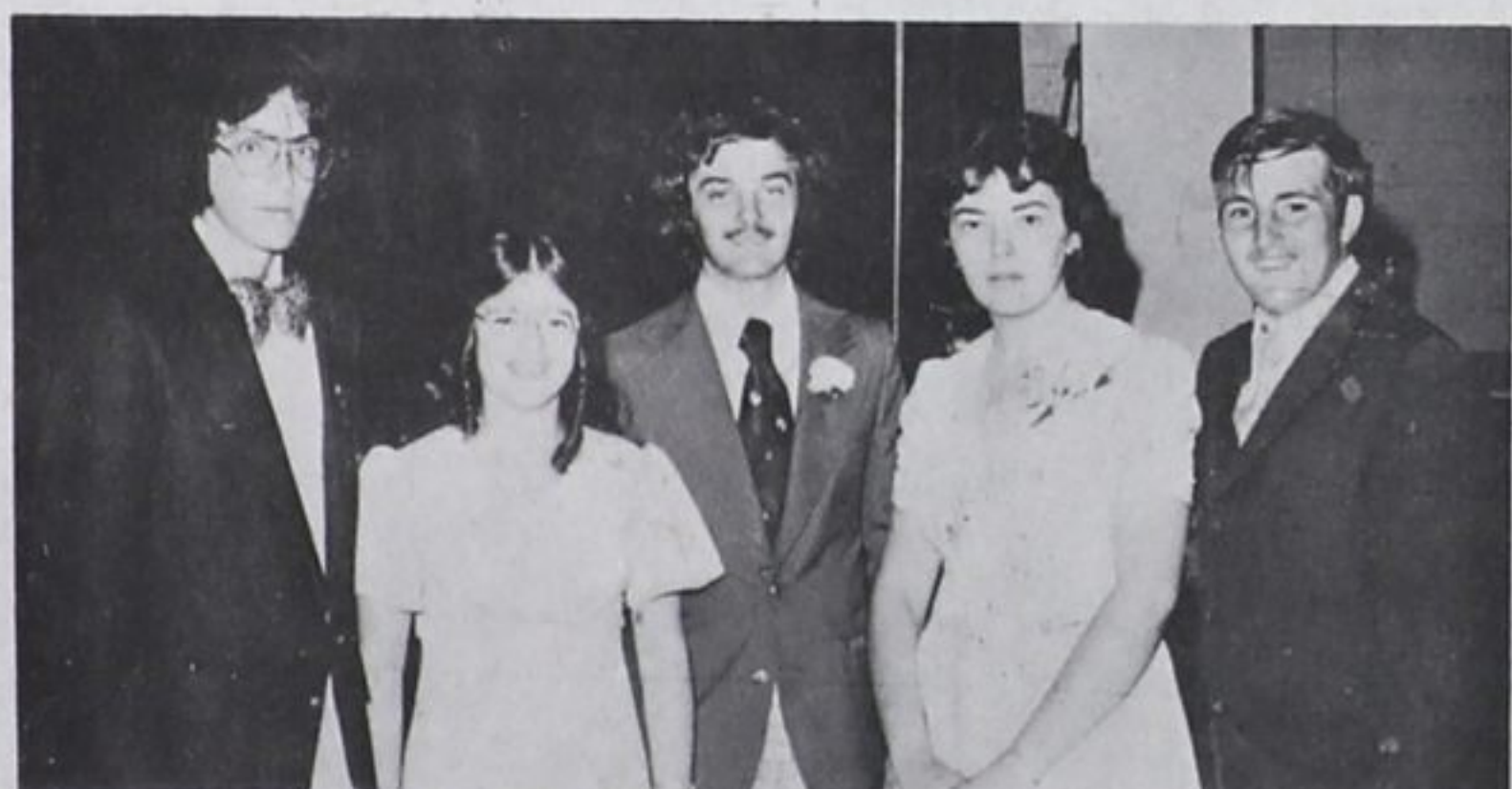
PSS Ontario Scholars