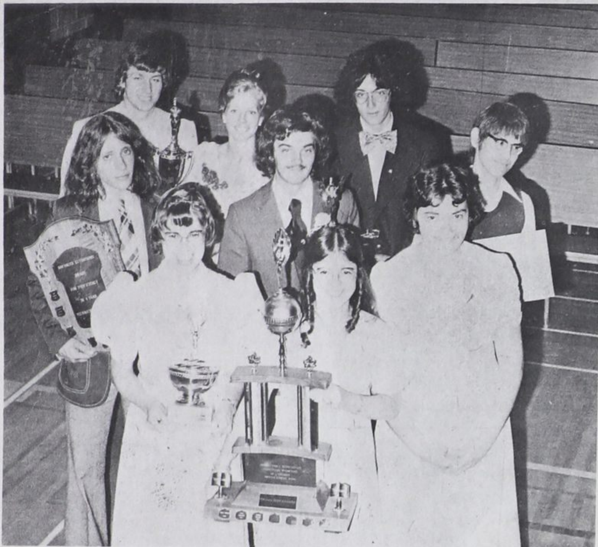
Major trophy winners

So on Saturday night when you make your way unsteadily home from the hotel and you see a monkey, you may not need the pledge. Rather, it may be only the wandering lover boy seeking his way in a harsh world.