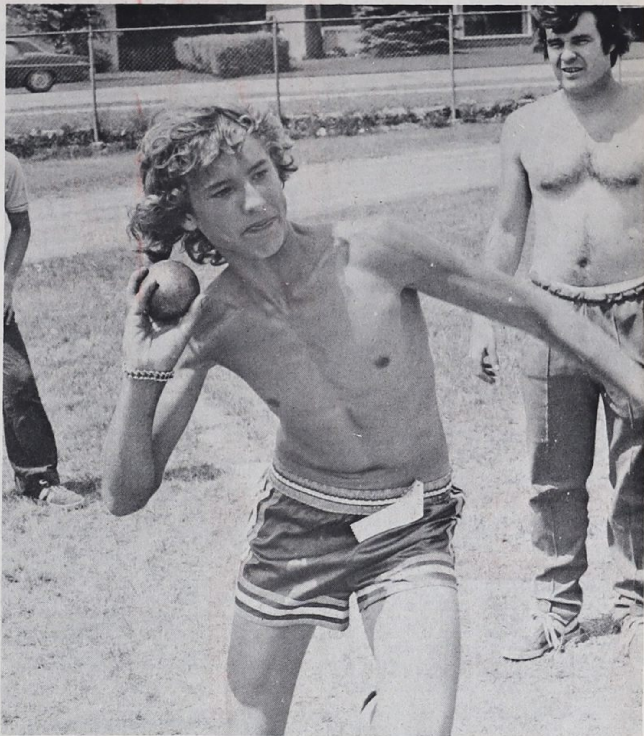
The big effort