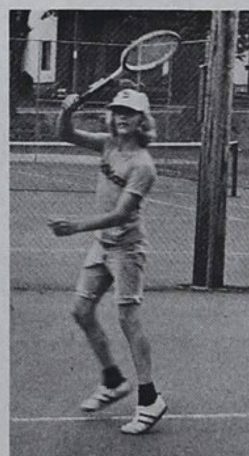
On the courts

Thursday nights is the night when you eager beavers can come out and catch up on the practice and instructions you've been needing. Lessons will be held from 7:30-9 p.m. at the low cost of $1.00 under the direction of skilled club members. If you're interested contact the town office. See you at the courts!