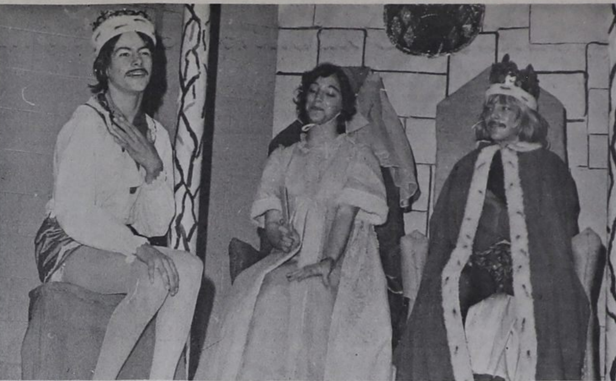
The prince's royal parents look on