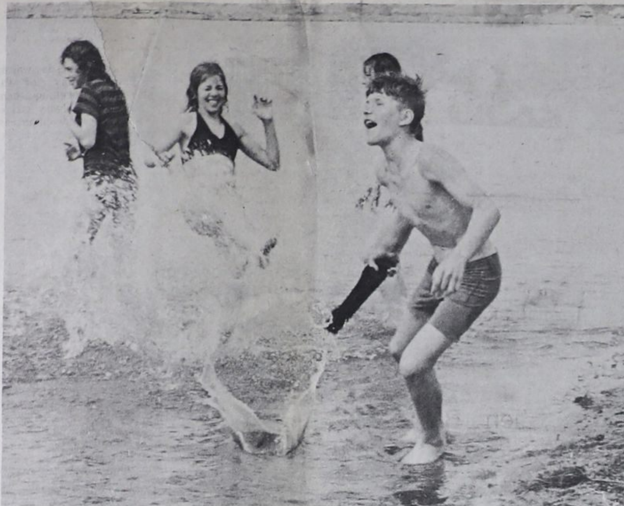
Cooling off at the Waterfront Park